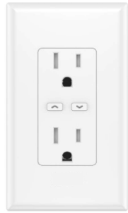
Wi-Fi Smart Wall Outlet Manual