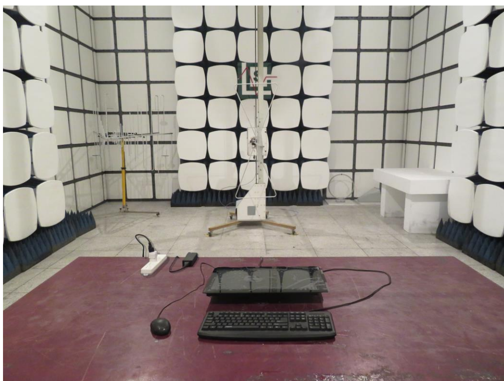
Radiated emission below 1GHz