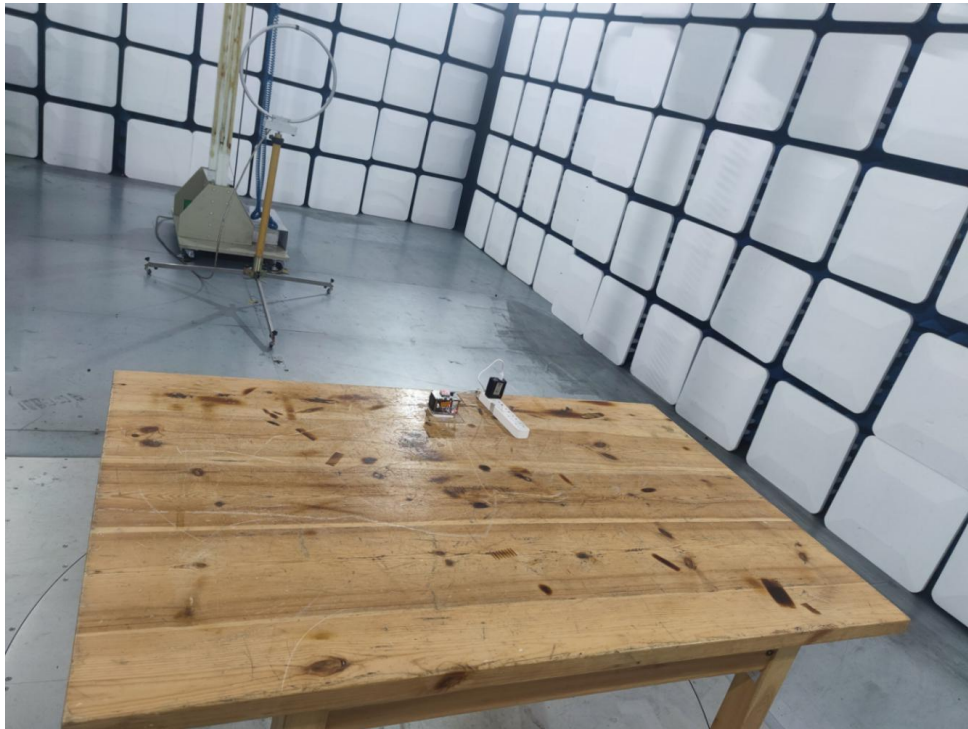
Photo of MPE Measurement