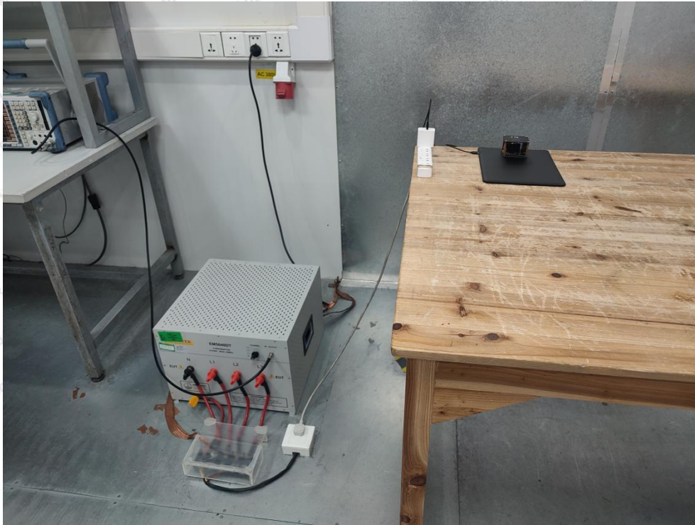
Photo of Radiation Emission Test