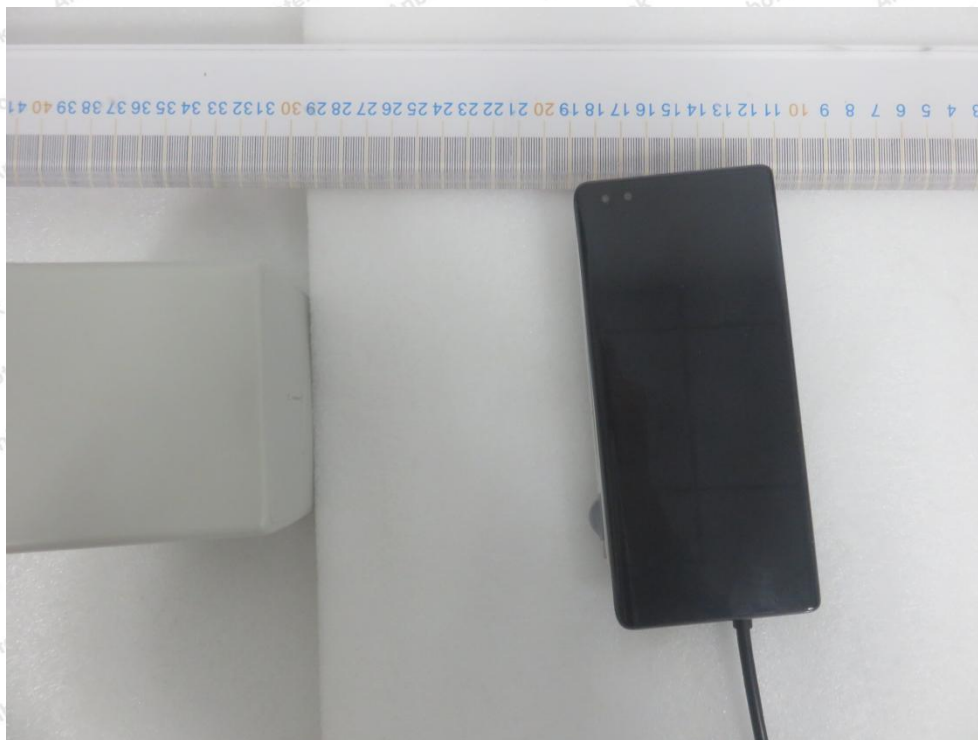
Photo of MPE Measurement