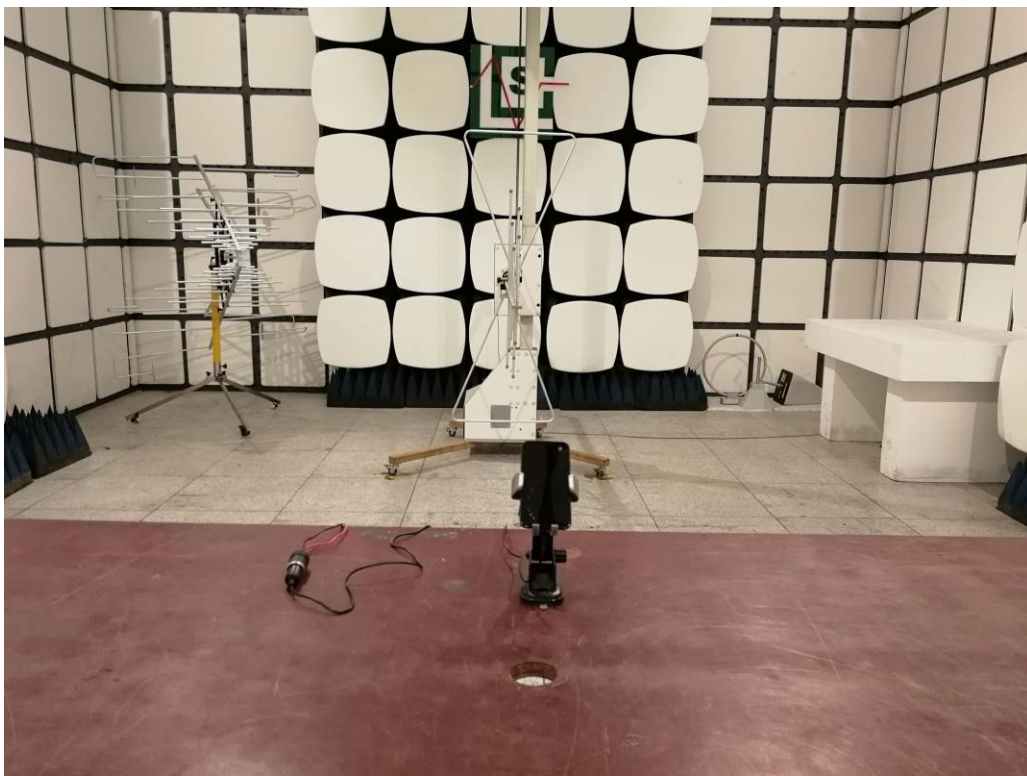
Radiated Emission below 1GHz- Car Charger charge mode