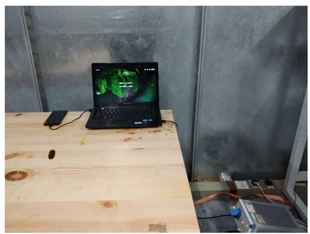
AC Conducted Emission of charge from PC mode

This report shall not be reproduced except in full, without the written approval of Shenzhen LCS Compliance Testing Laboratory Ltd.. Page 2 of 2