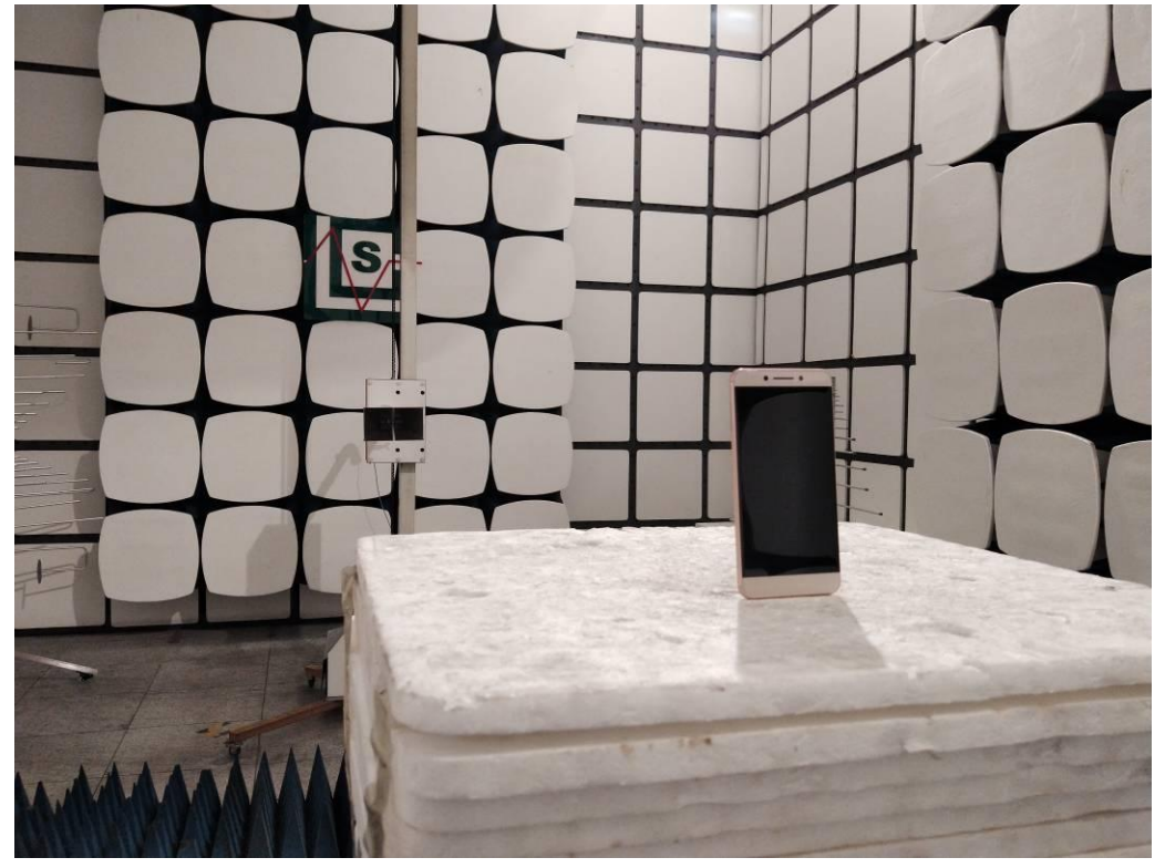
Fig. 2 (Above 1GHz)