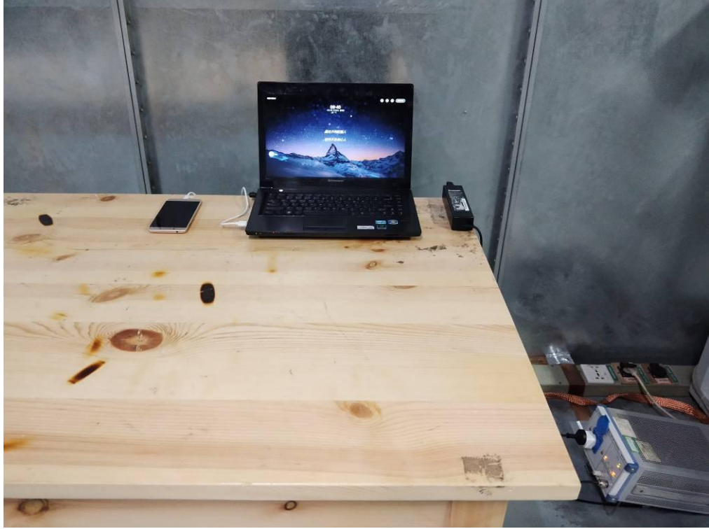
AC Conducted Emission of charge from PC mode