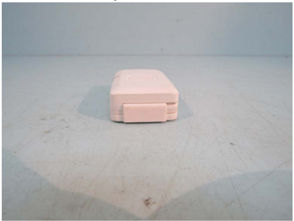
Bottom View of The Product