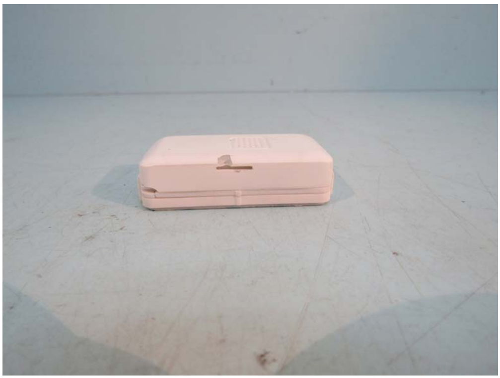
Right View of The Product