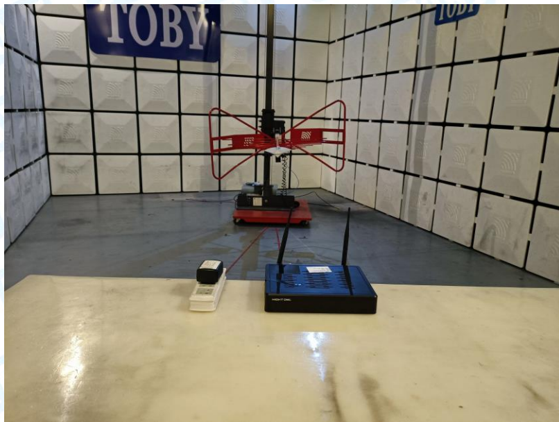
Photo of Setup for Conducted Emission