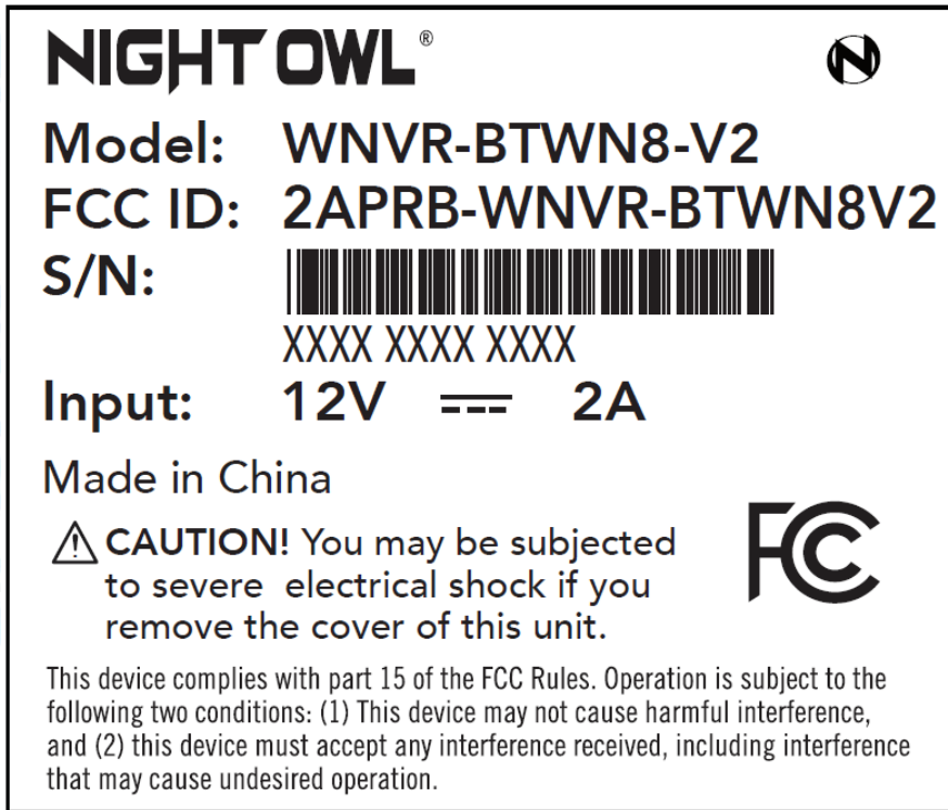
Size for the label: 60mm X 52mm