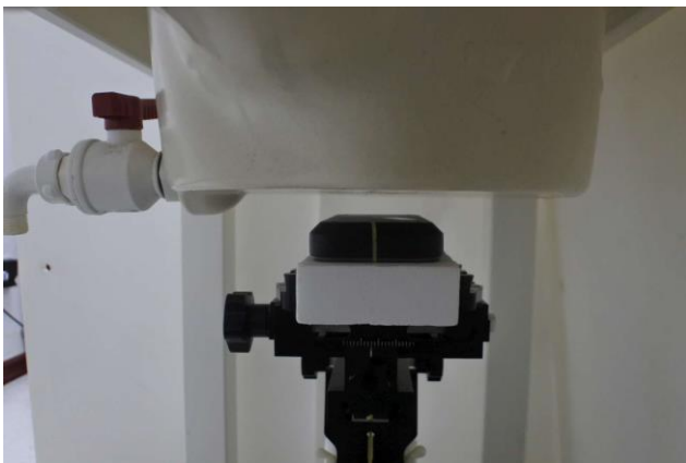
Back, Test Separation 17 mm