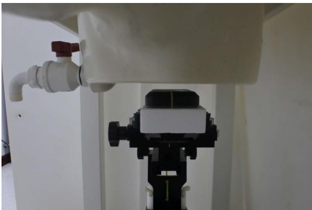
Back, Test Separation 10 mm