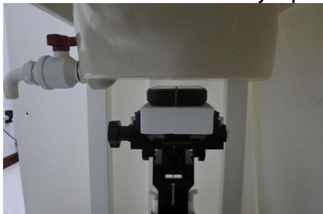
Front, Test Separation 10 mm