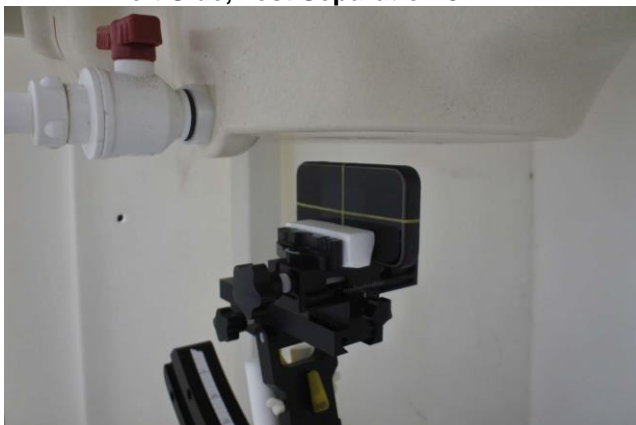
Top Side, Test Separation 18 mm