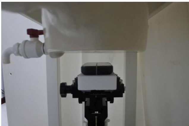
Front, Test Separation 21 mm