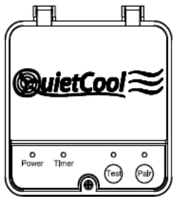
Fig. 3 Connection Wires of IT-RFHUB-01