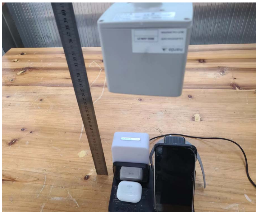
Test Position F-20cm from the edge of EUT to the geometric center of the probe