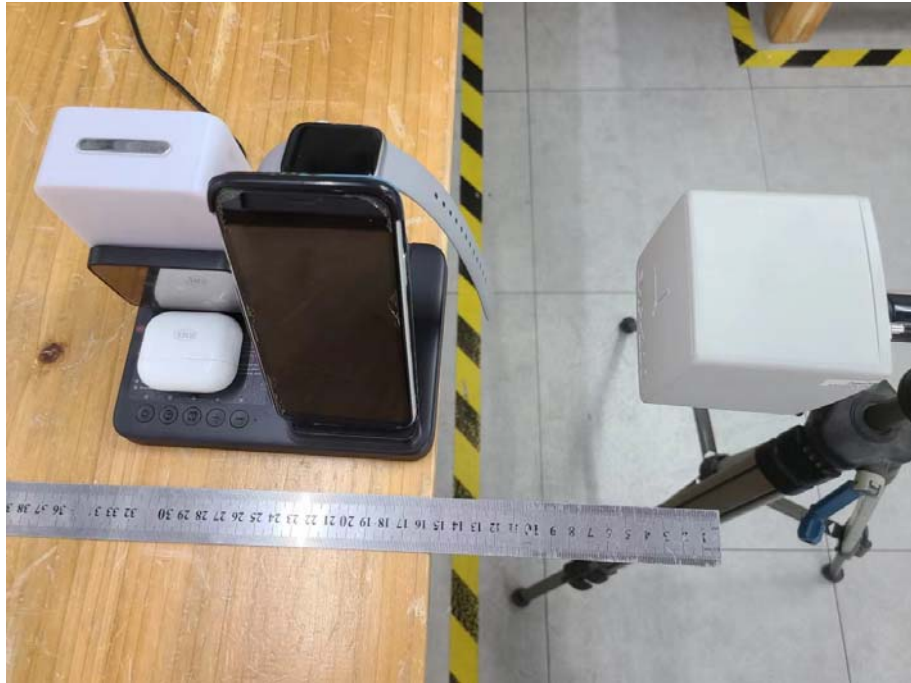
Test Position C-15cm from the edge of EUT to the geometric center of the probe