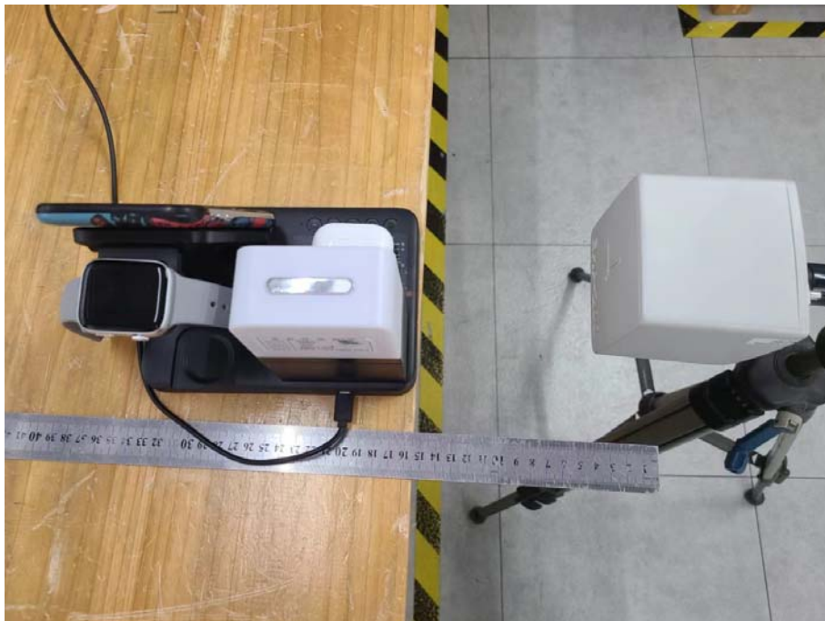
Test Position B-15cm from the edge of EUT to the geometric center of the probe