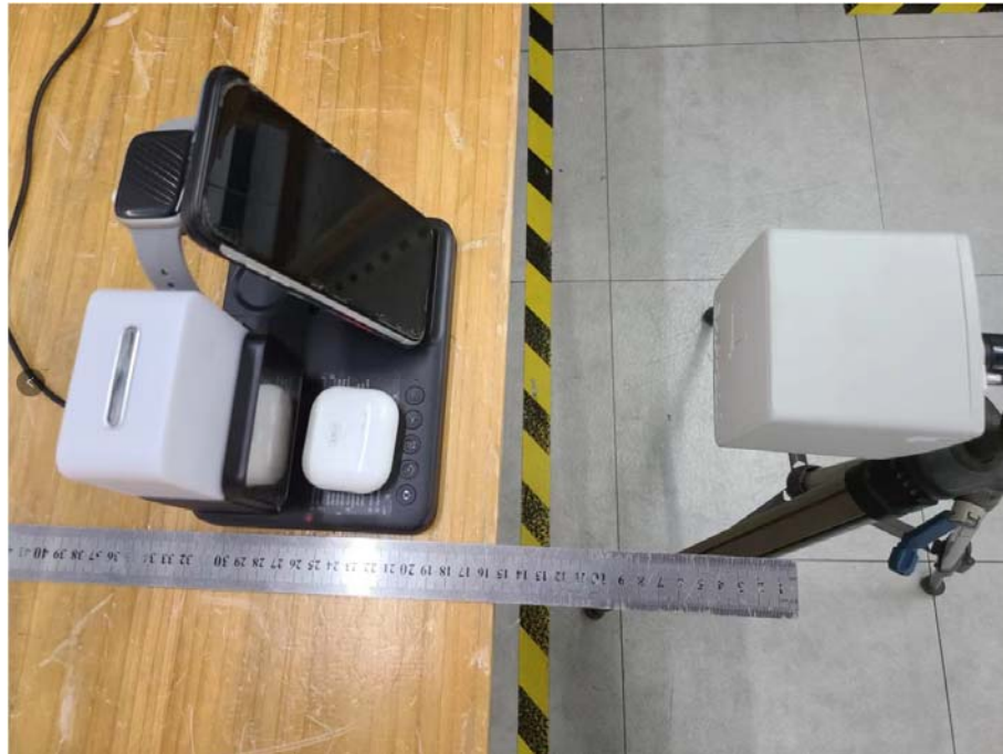
Test Position A-15cm from the edge of EUT to the geometric center of the probe