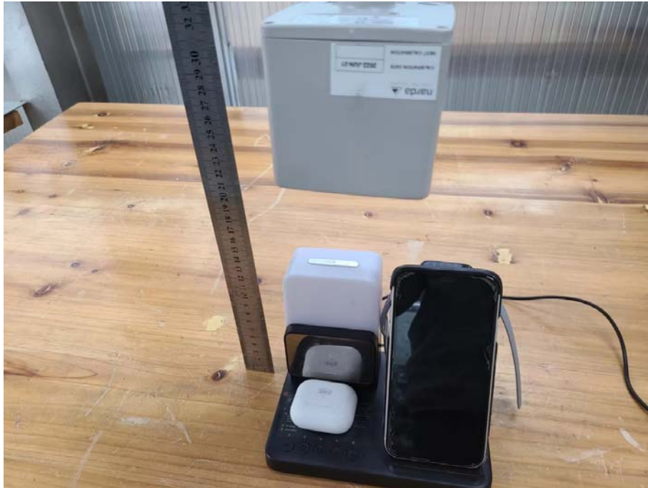
Test Position E-15cm from the edge of EUT to the geometric center of the probe