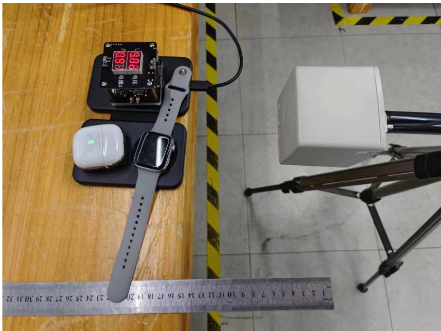
Test Position D-15cm from the edge of EUT to the geometric center of the probe