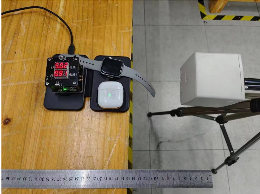
Test Position C-15cm from the edge of EUT to the geometric center of the probe