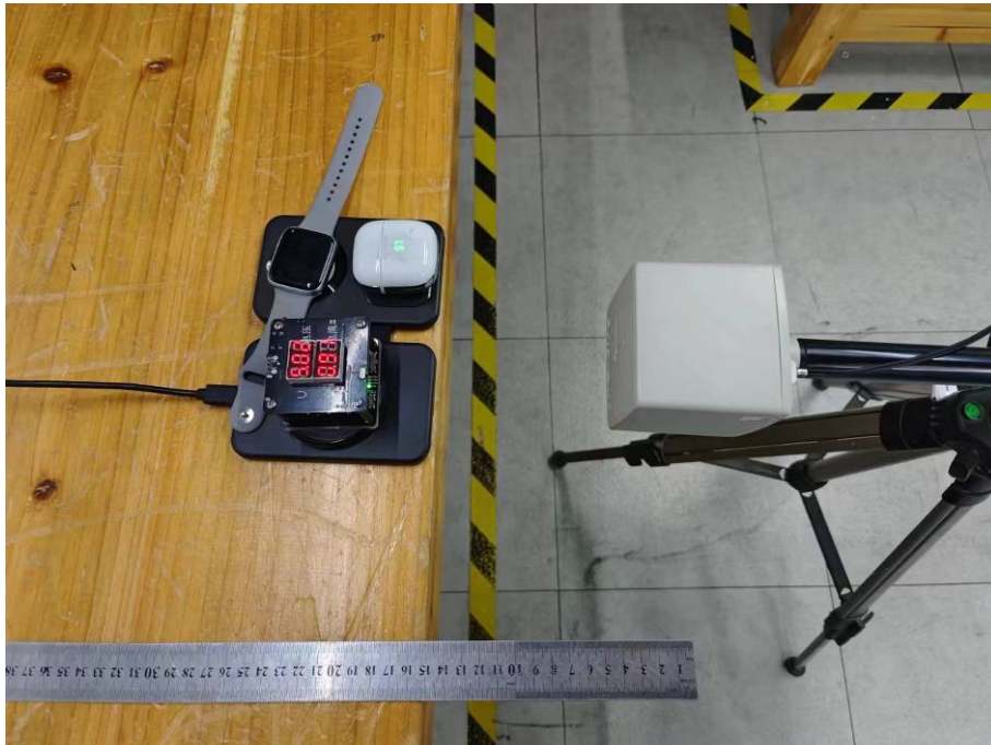
Test Position A-15cm from the edge of EUT to the geometric center of the probe