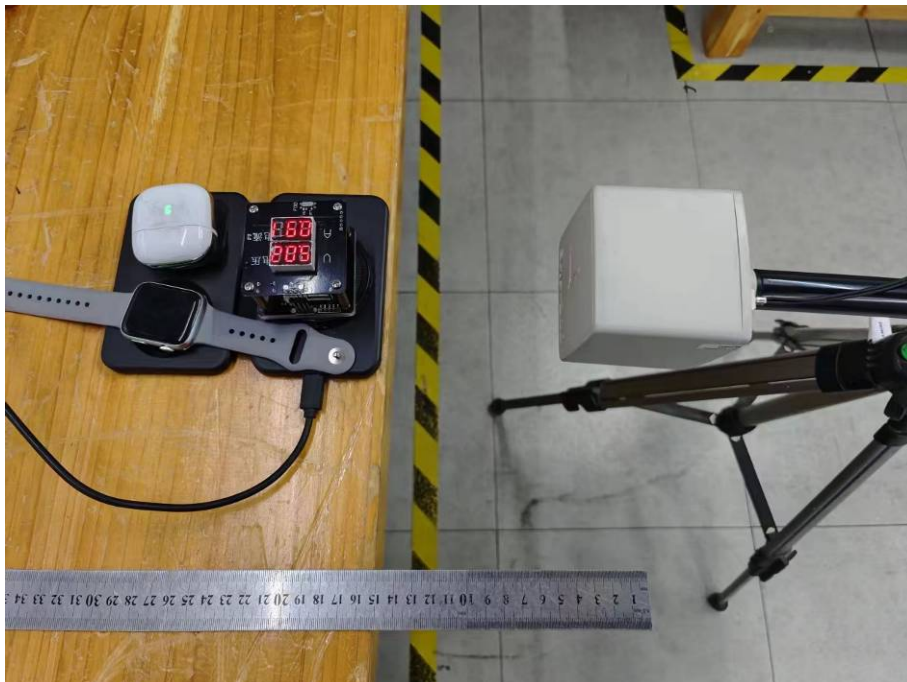
Test Position B-15cm from the edge of EUT to the geometric center of the probe