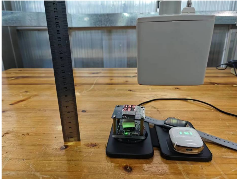
Test Position E-15cm from the edge of EUT to the geometric center of the probe