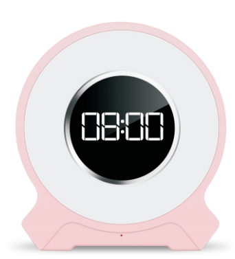
Bluetooth speaker F9

Please read the user manual carefully before using the device