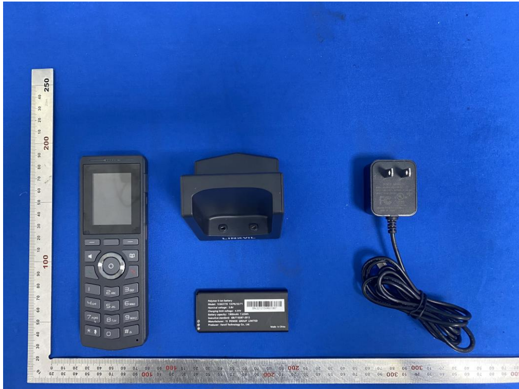
VIEW OF ADAPTER