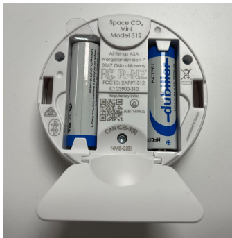
Label location unfolded table stand