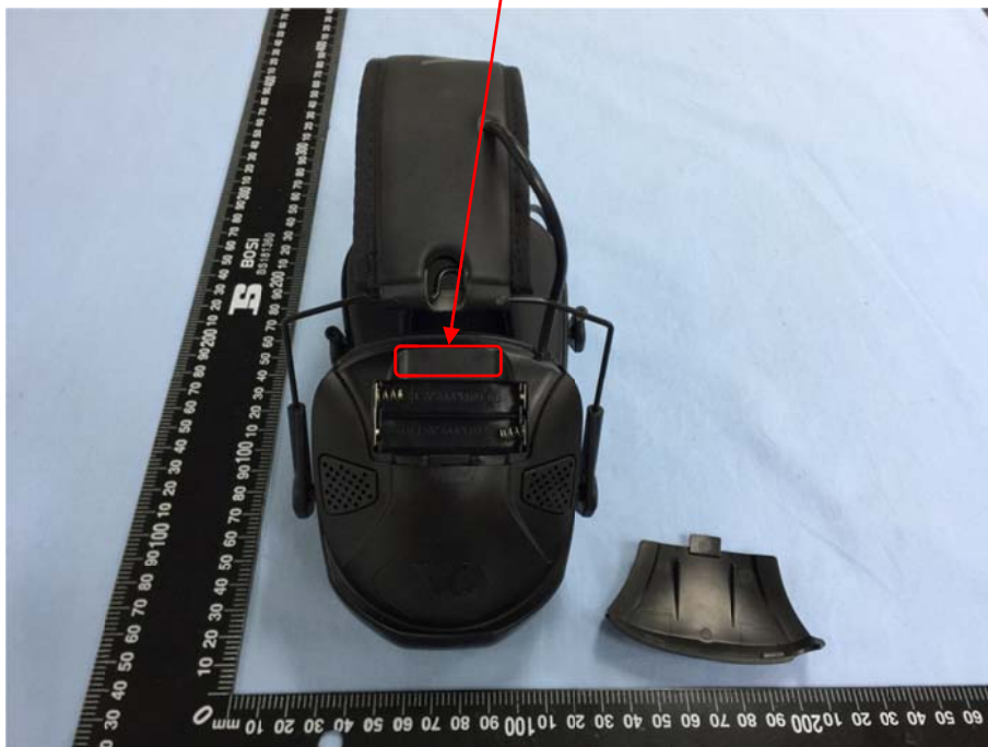
FCC ID Label Location