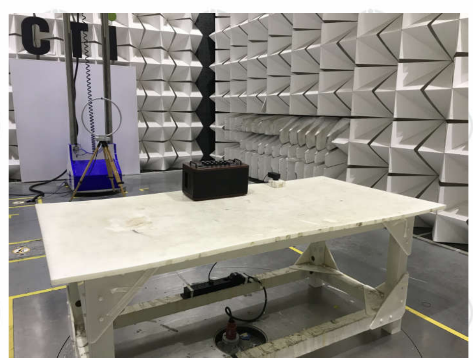
Radiated spurious emission Test Setup-1 (Below 30M)