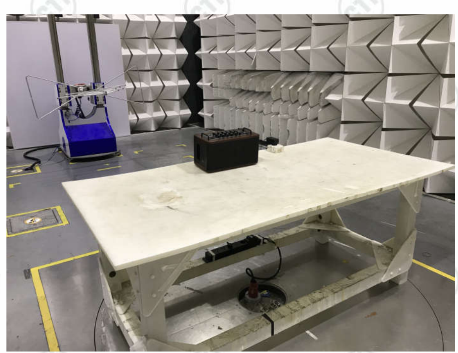
Radiated spurious emission Test Setup-2 (Below 1GHz)