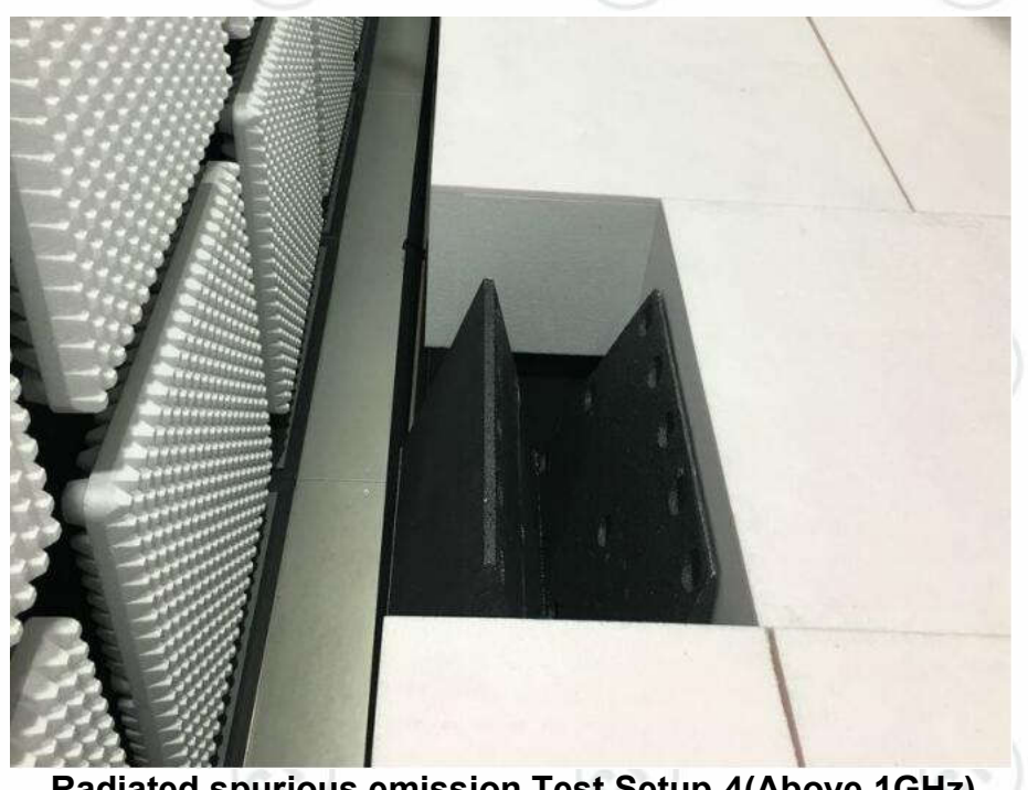
Radiated spurious emission Test Setup-4(Above 1GHz) There are absorbing materials under the ground.