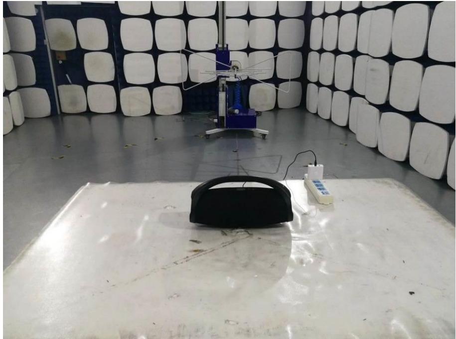
Radiated emission – above 1GHz