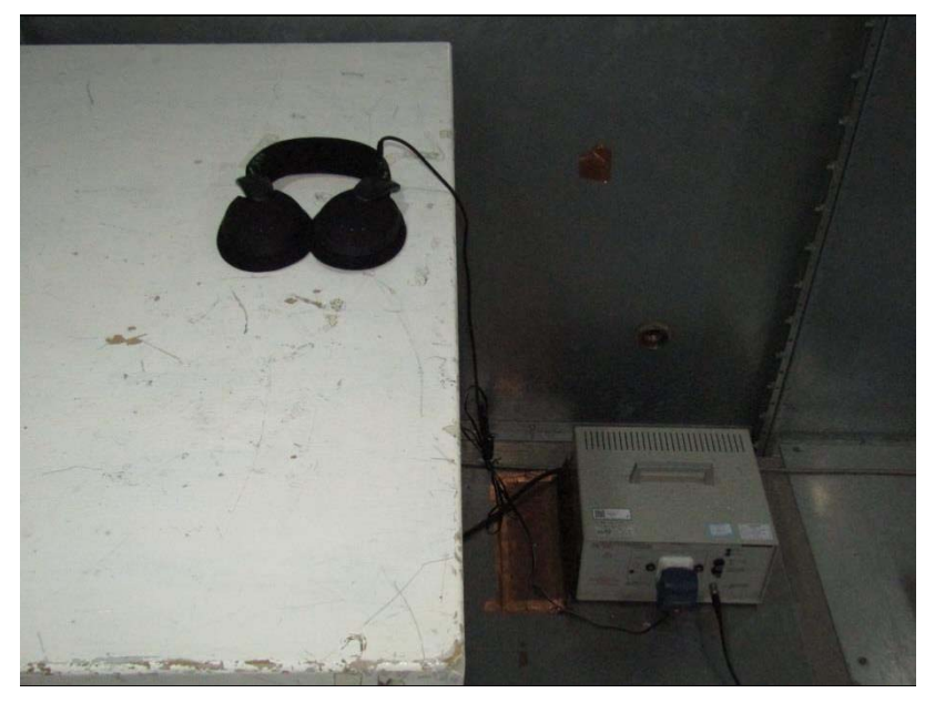
Measurement of Conducted Emission Test Set Up

Measurement of Radiated Emission Test Set Up