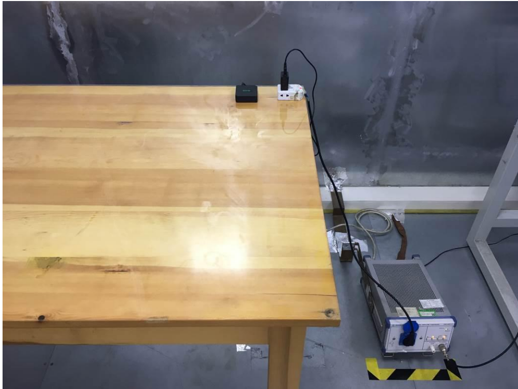
Power Line Conducted Emission