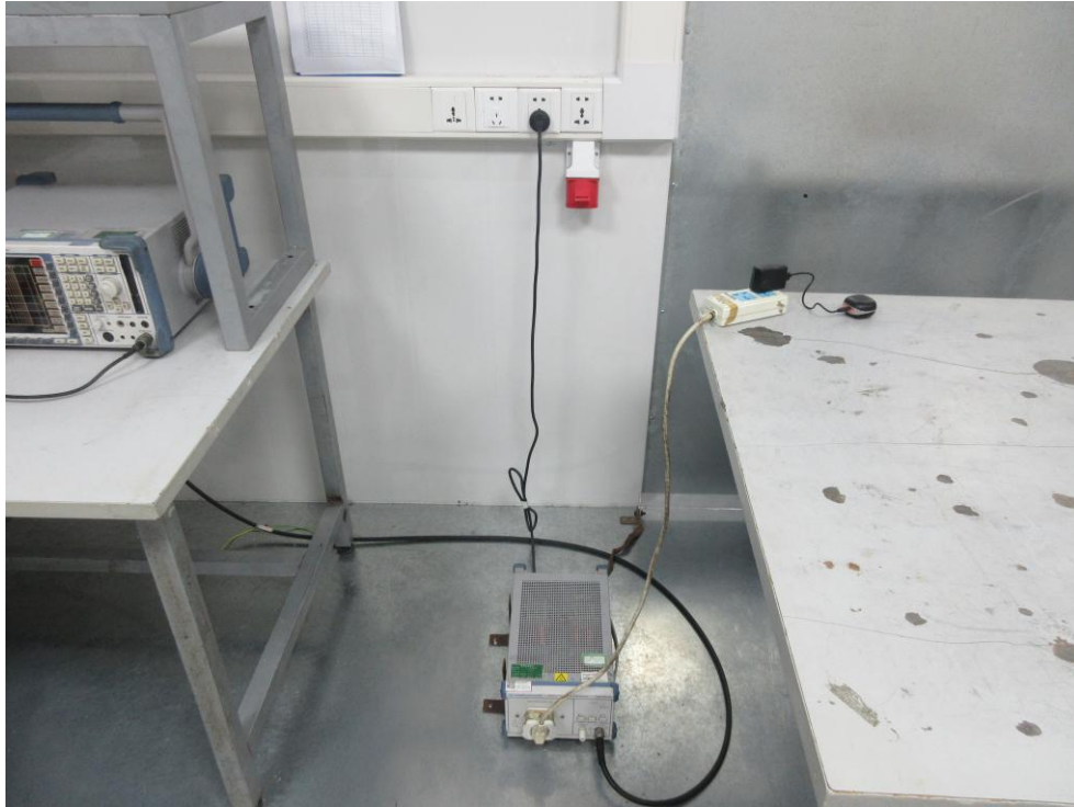
Photo of Radiation Emission Test