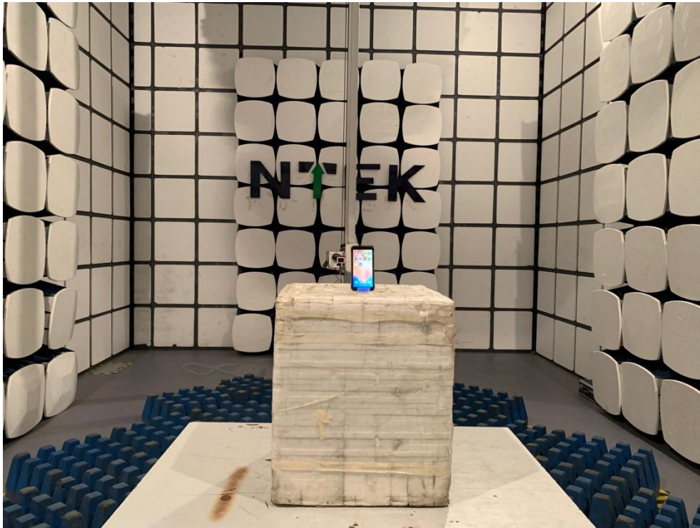
AC Conducted Measurement Photos