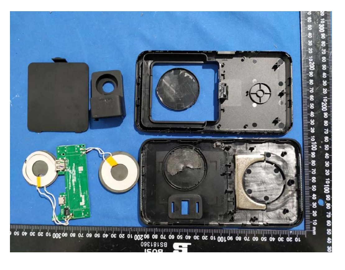
EXHIBIT C - EUT INTERNAL PHOTOGRAPHS