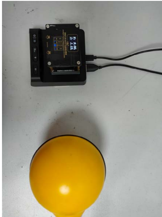
Position D: 15 cm