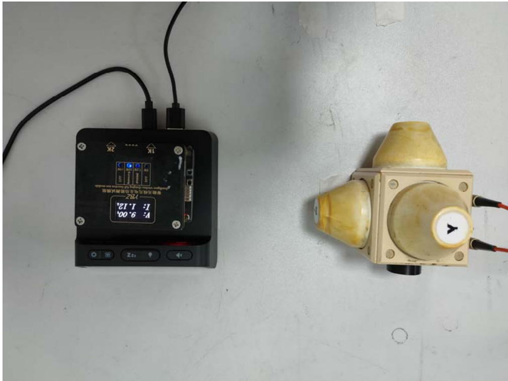
Position D: 15 cm