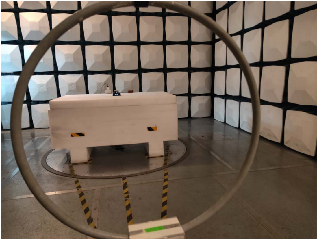
Radiated Emission Below 1GHz View