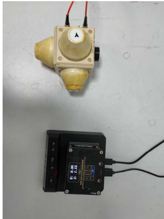
Position B: 15 cm