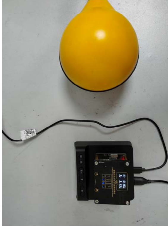
Position B: 15 cm