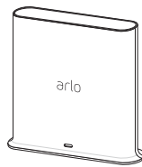
Arlo Gen5 Entry Hub