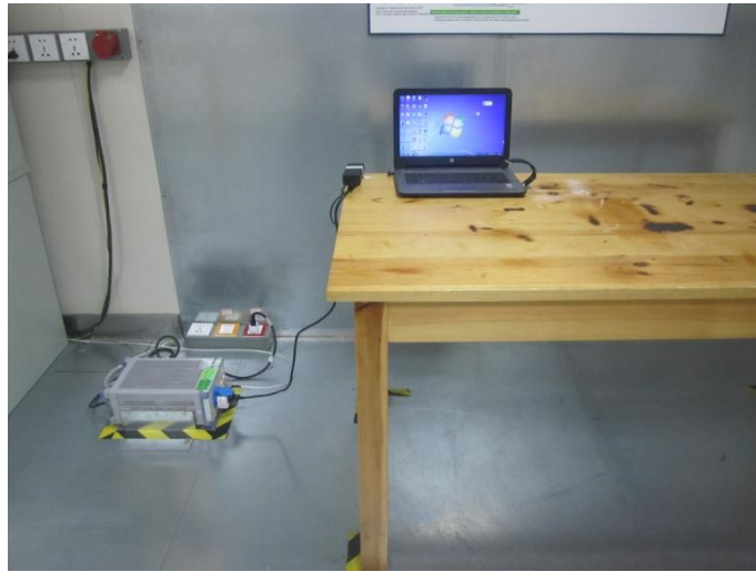
DTS radiation L