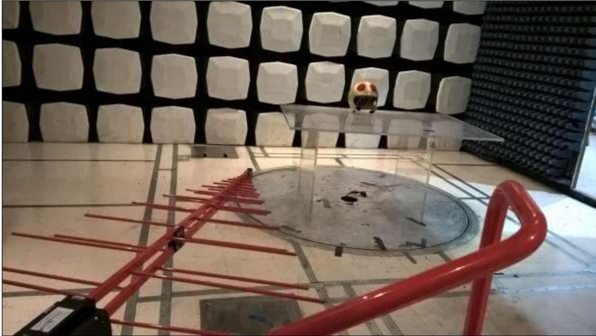
Photograph 2. Radiated Emissions, below 1 GHz setup