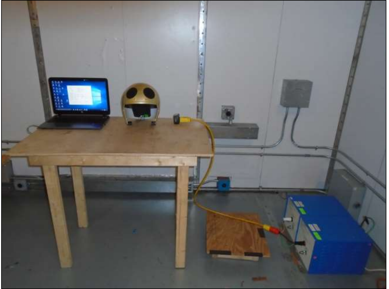
Photograph 1. Conducted Emissions, 15.207(a), Test Setup