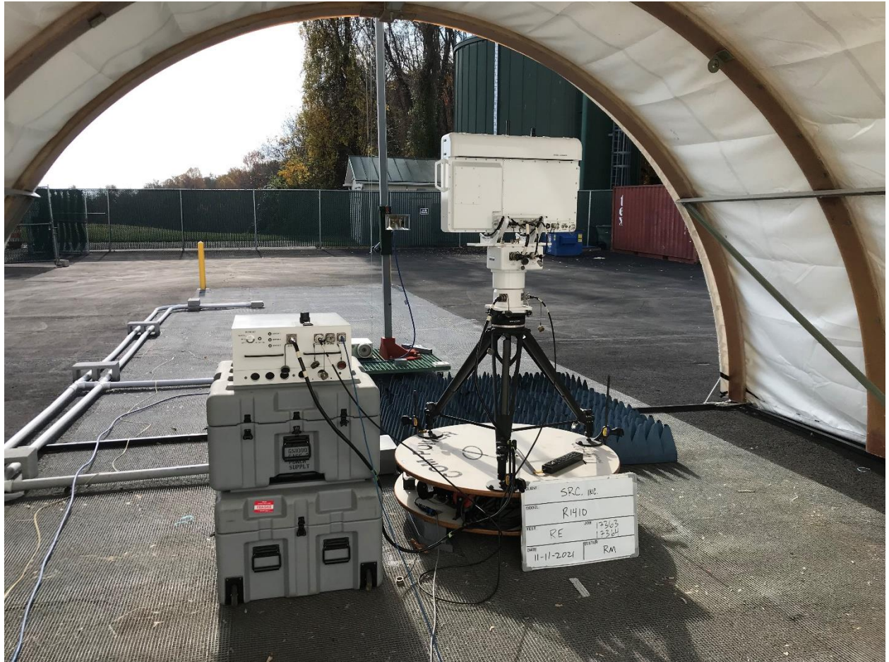
RE Above Rear 2