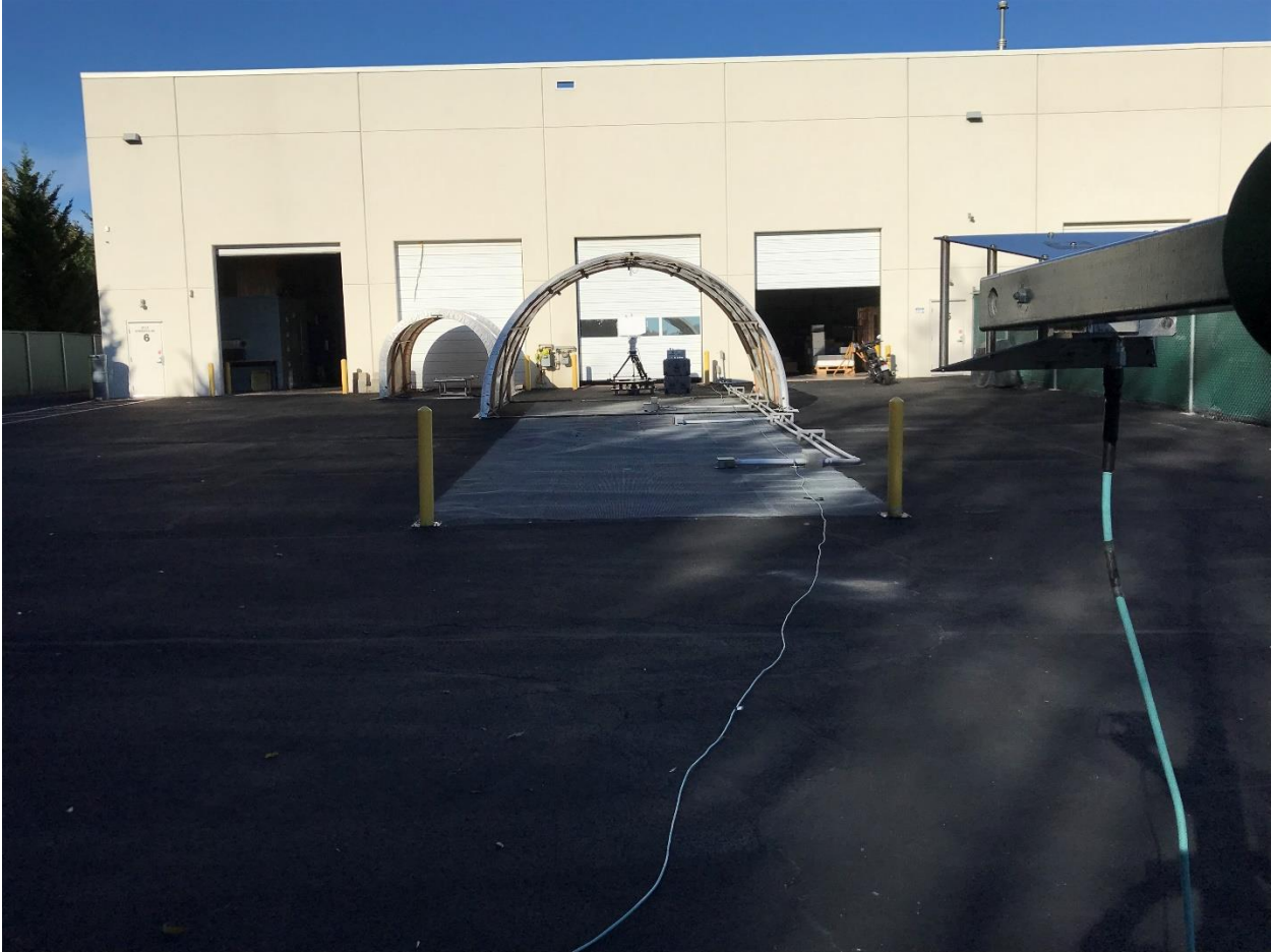
RE Front, 30m