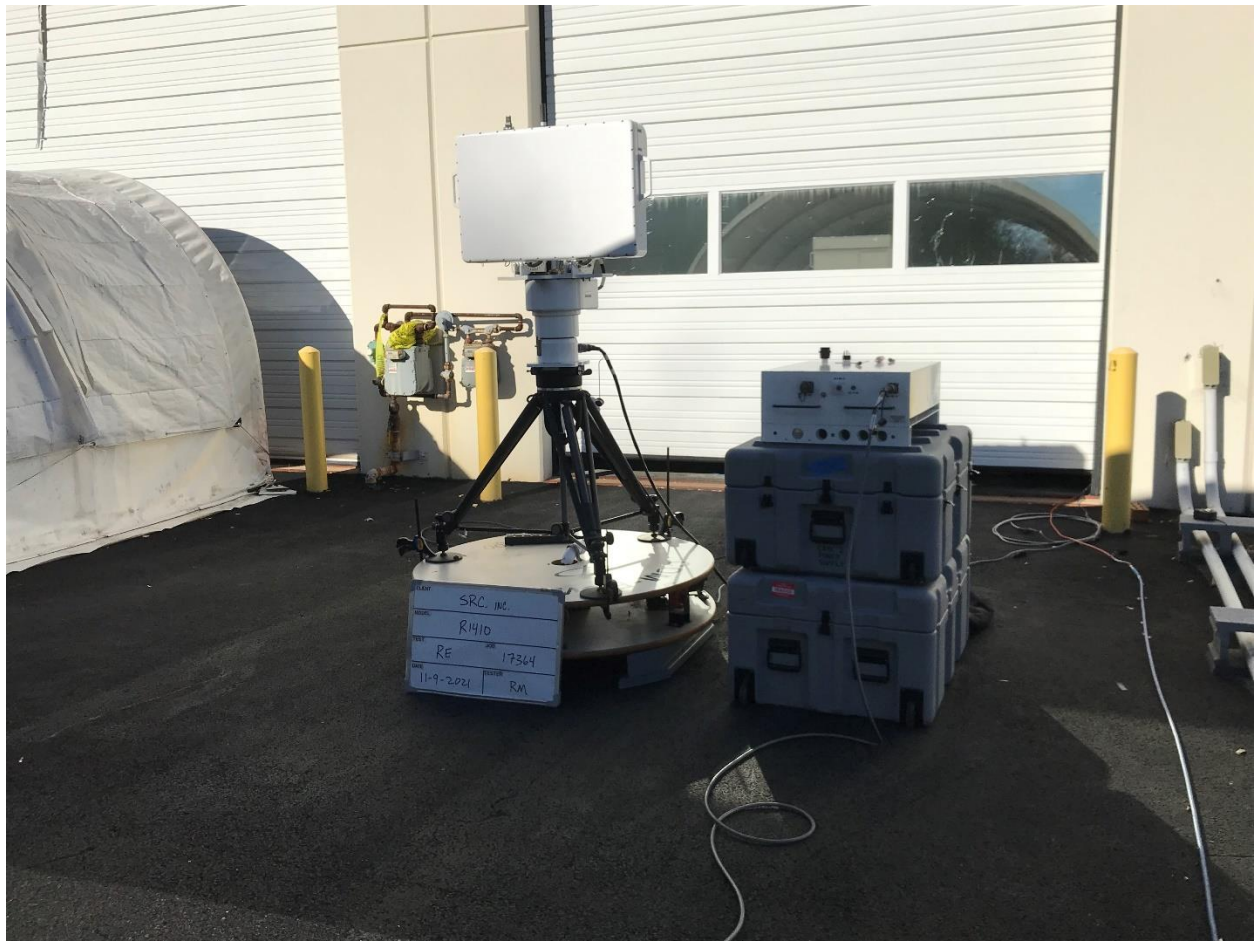
RE Front, 30m