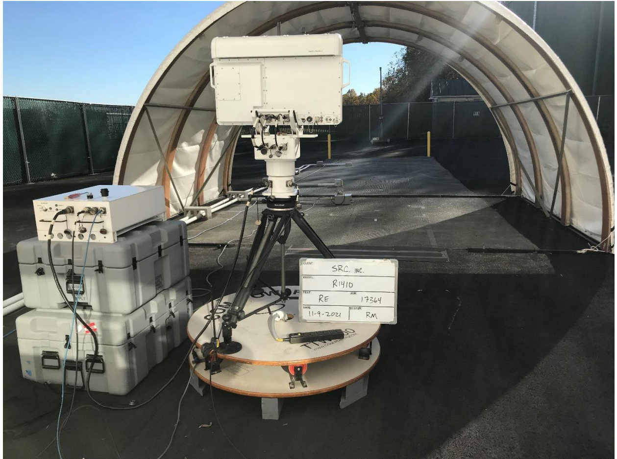
RE Rear, 30m