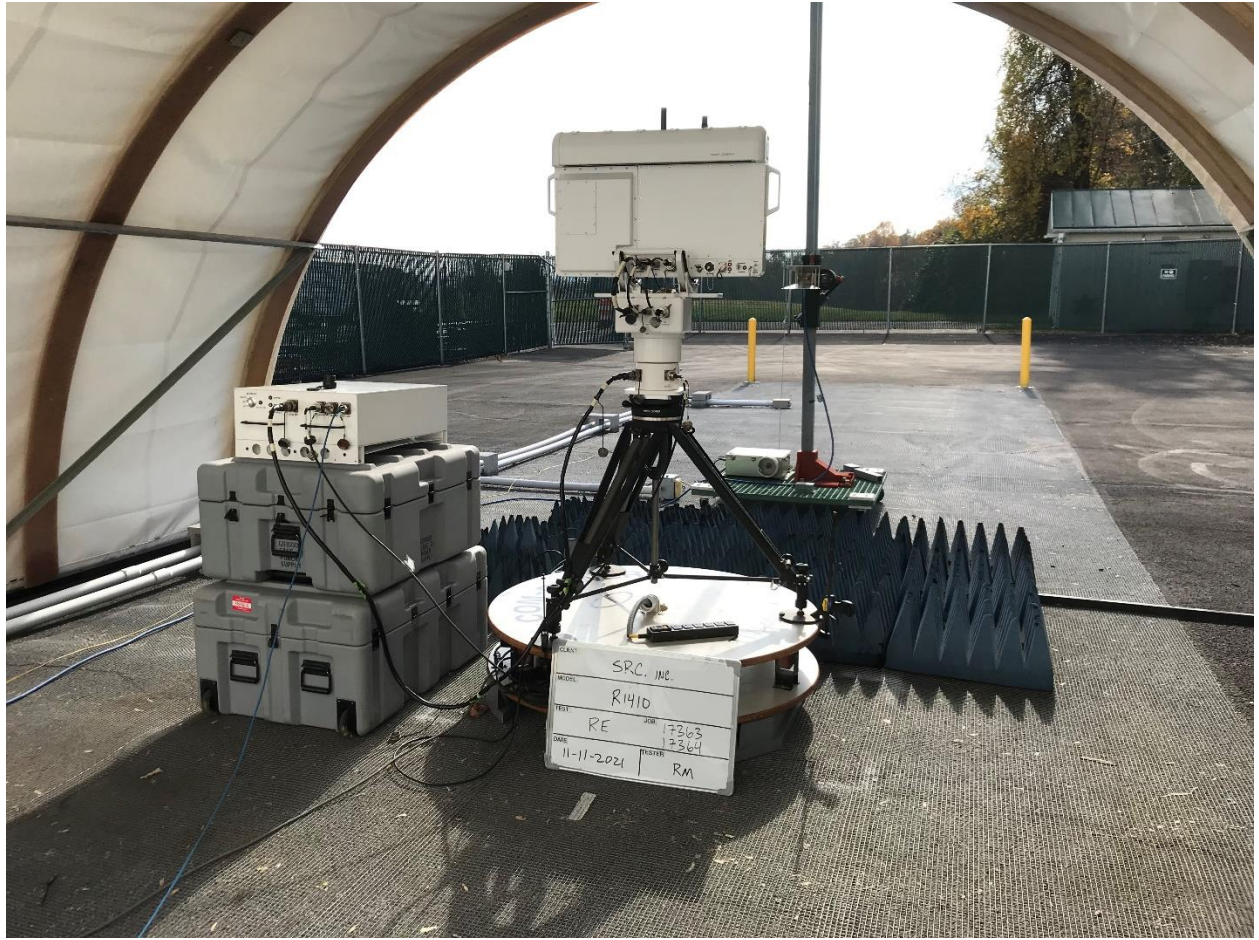
RE Above Rear 1