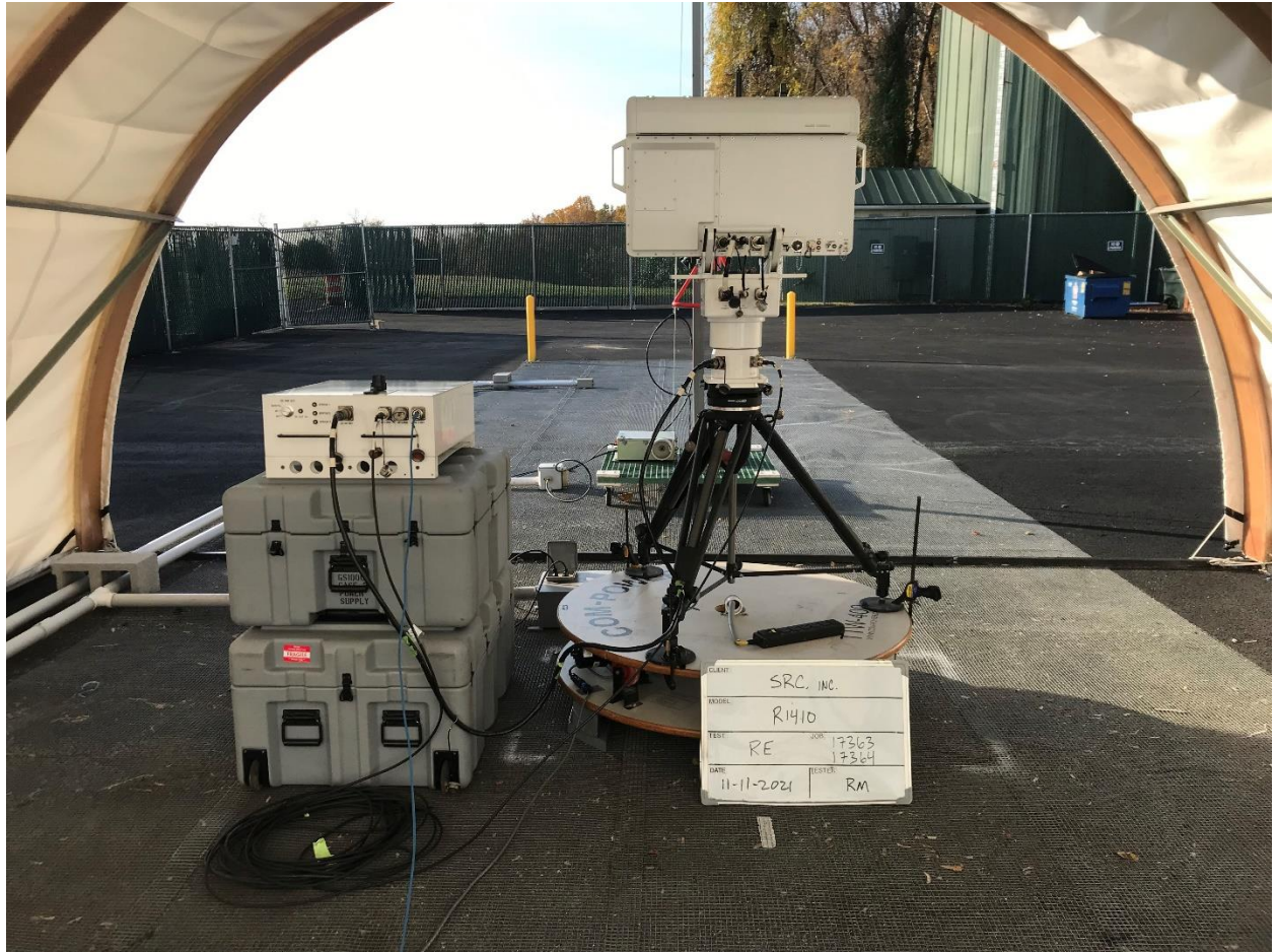
RE Below Rear 1