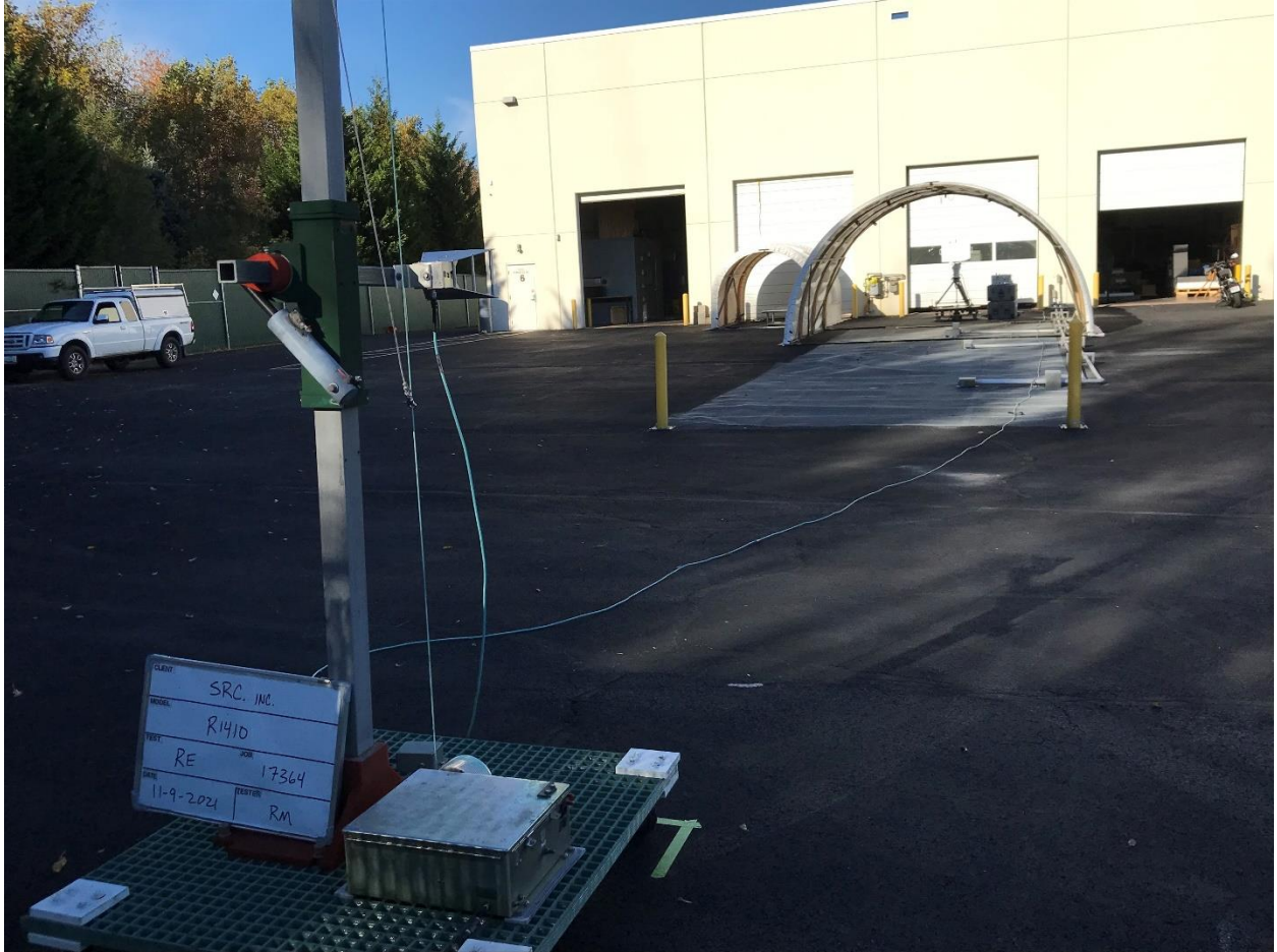
RE Front, 30m