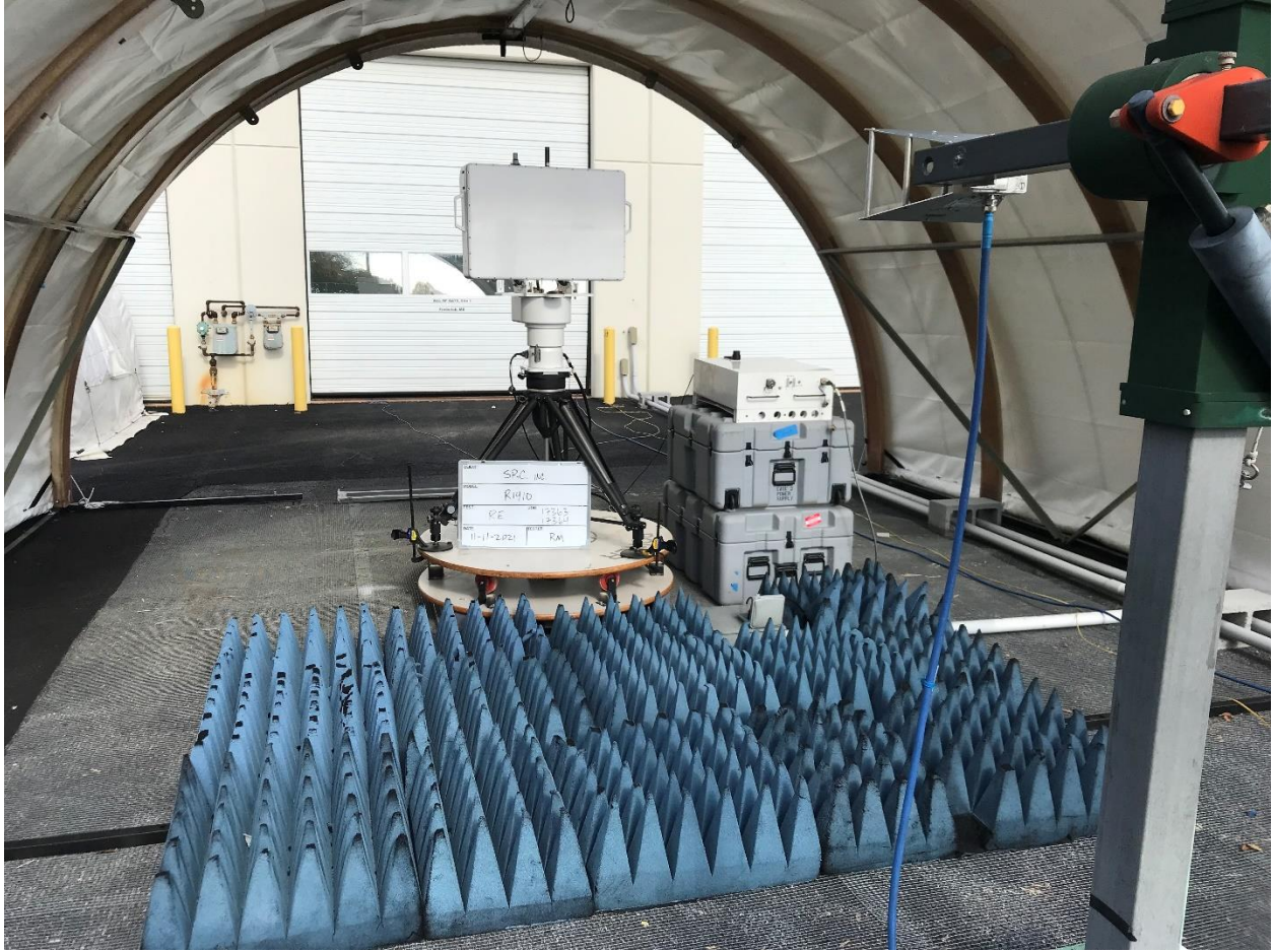
RE Above Front 1