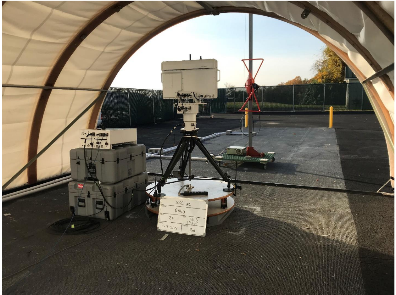
RE Below Rear 2