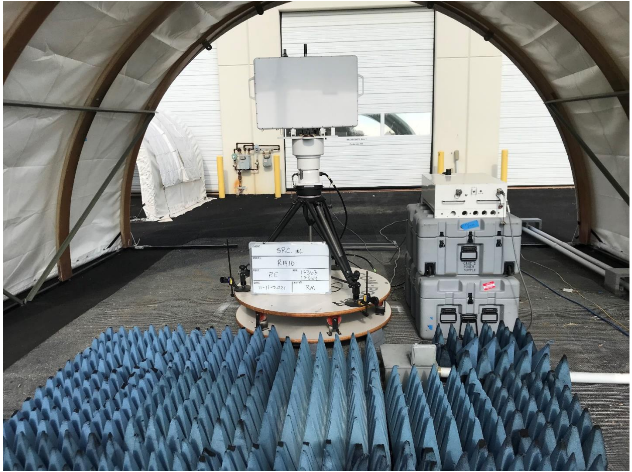
RE Above Front 2