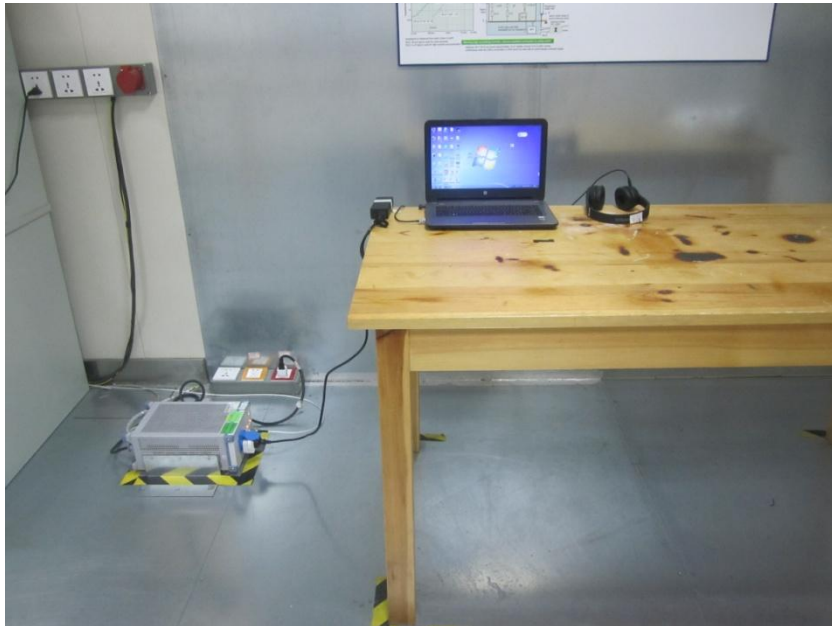
DSS radiation L