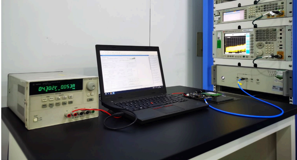
Radiated Spurious Emissions Above 1GHz