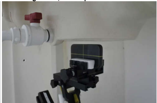
Bottom Side, Test Separation 10 mm