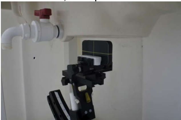
Top Side, Test Separation 10 mm