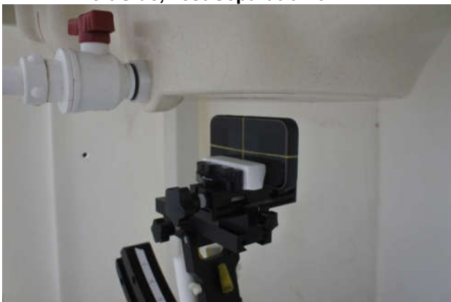
Top Side, Test Separation 18 mm