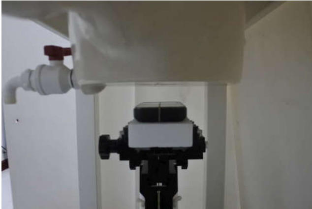
Front, Test Separation 21 mm