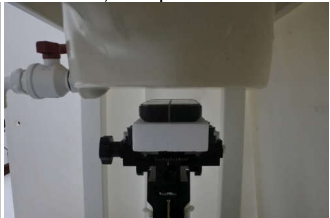
Front, Test Separation 17 mm