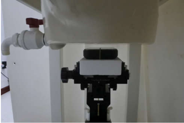
Front, Test Separation 10 mm