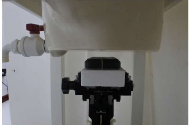
Back, Test Separation 17 mm