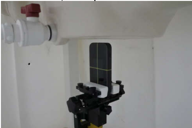
Left Side, Test Separation 10 mm