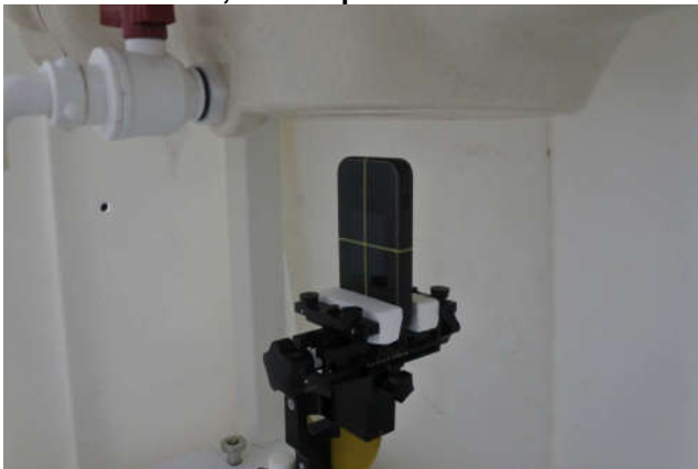
Left Side, Test Separation 31 mm