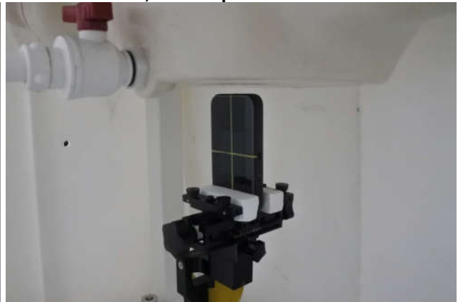
Right Side, Test Separation 10 mm