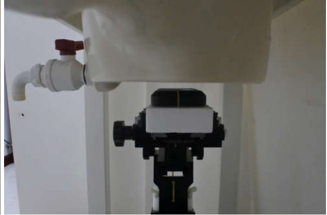
Back, Test Separation 10 mm