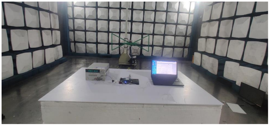
Radiated Spurious Emissions (Below 1GHz)