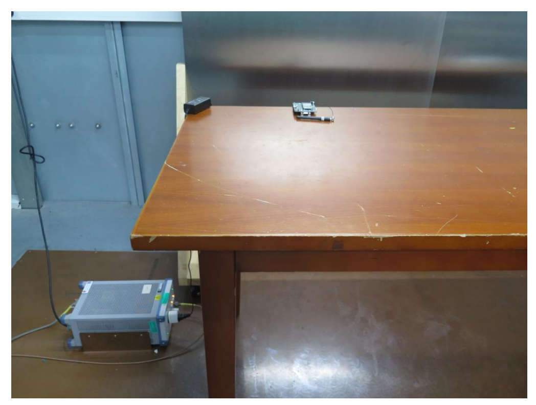
Pic2. Conducted (150KHz-30MHz)