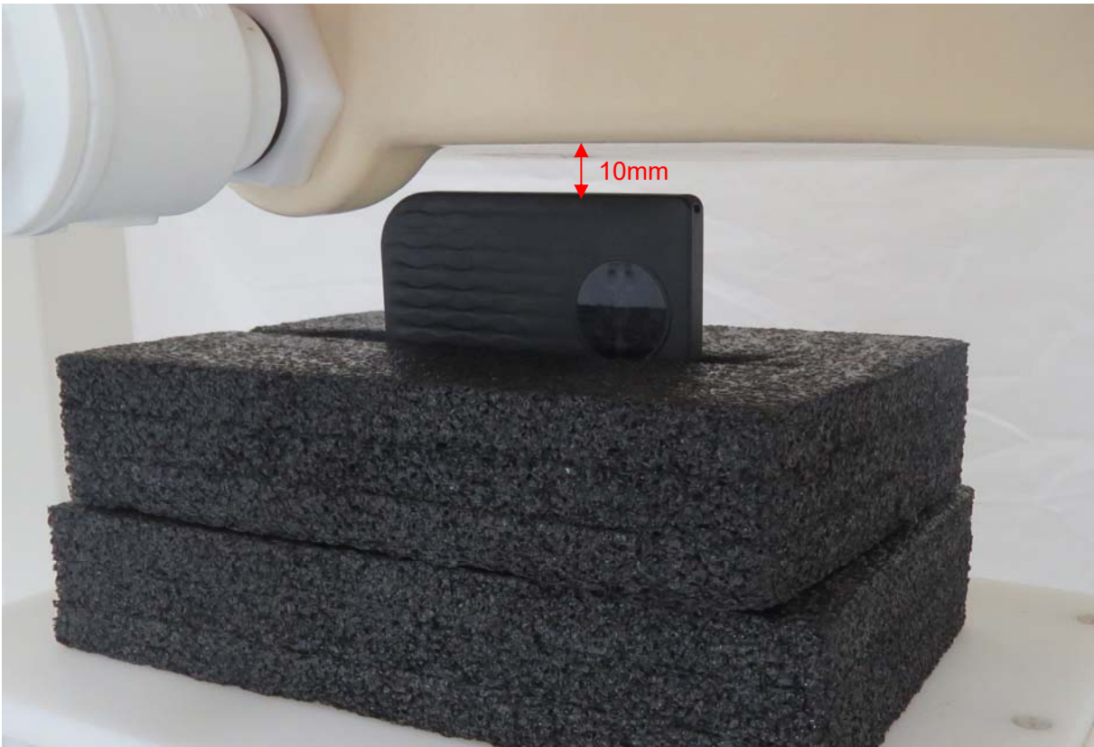
Picture 5: Left Edge, the distance from handset to the bottom of the Phantom is 10mm