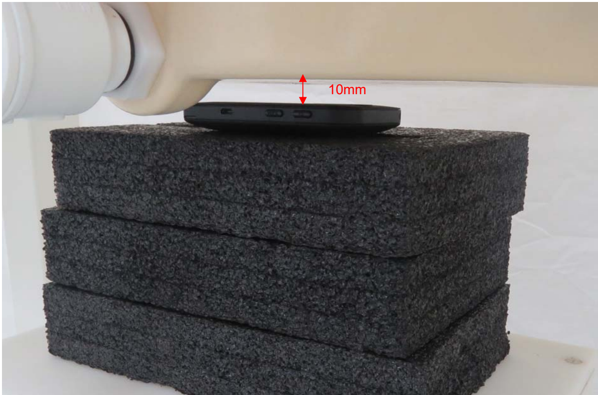
Picture 4: Front Side, the distance from handset to the bottom of the Phantom is 10mm