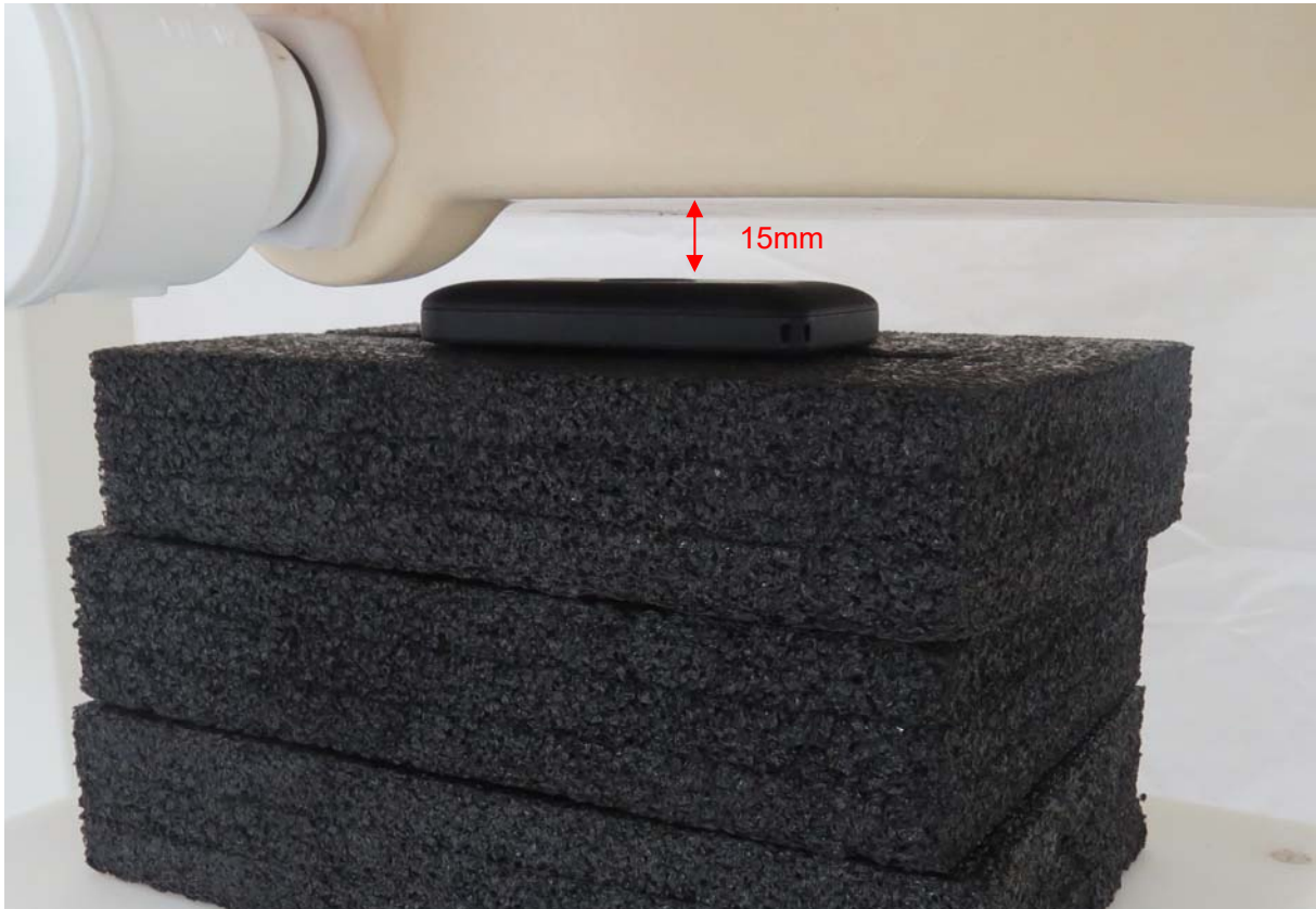
Picture 1: Back Side, the distance from handset to the bottom of the Phantom is 15mm