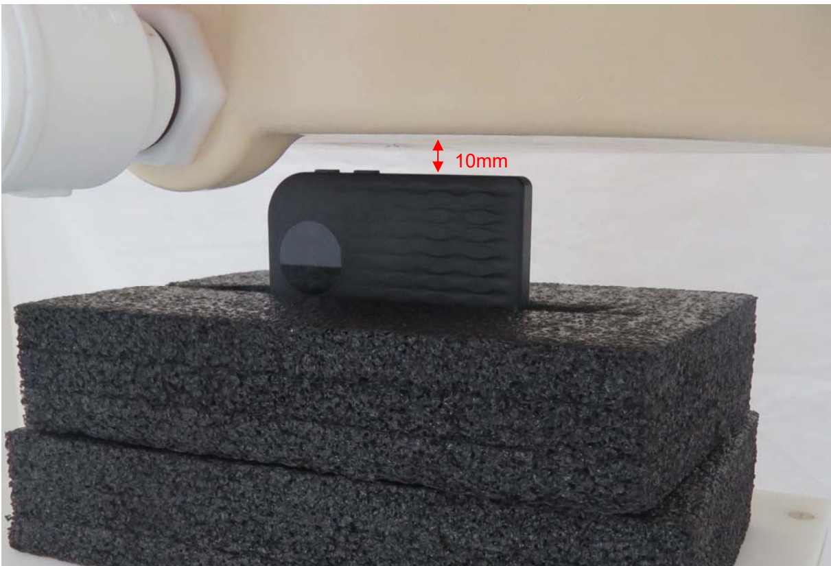
Picture 6: Right Edge, the distance from handset to the bottom of the Phantom is 10mm