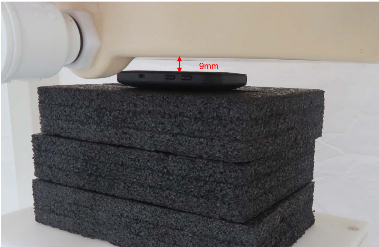
Picture 10: Front Side, the distance from handset to the bottom of the Phantom is 9mm