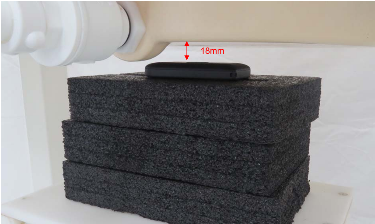
Picture 9: Back Side, the distance from handset to the bottom of the Phantom is 18mm