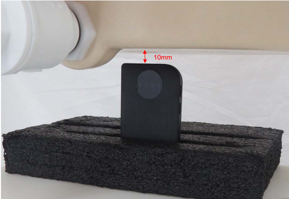
Picture 7: Top Edge, the distance from handset to the bottom of the Phantom is 10mm