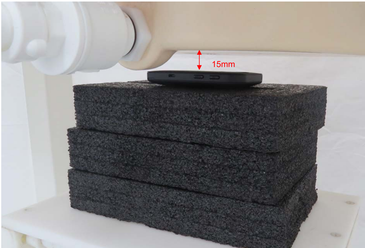
Picture 2: Front Side, the distance from handset to the bottom of the Phantom is 15mm