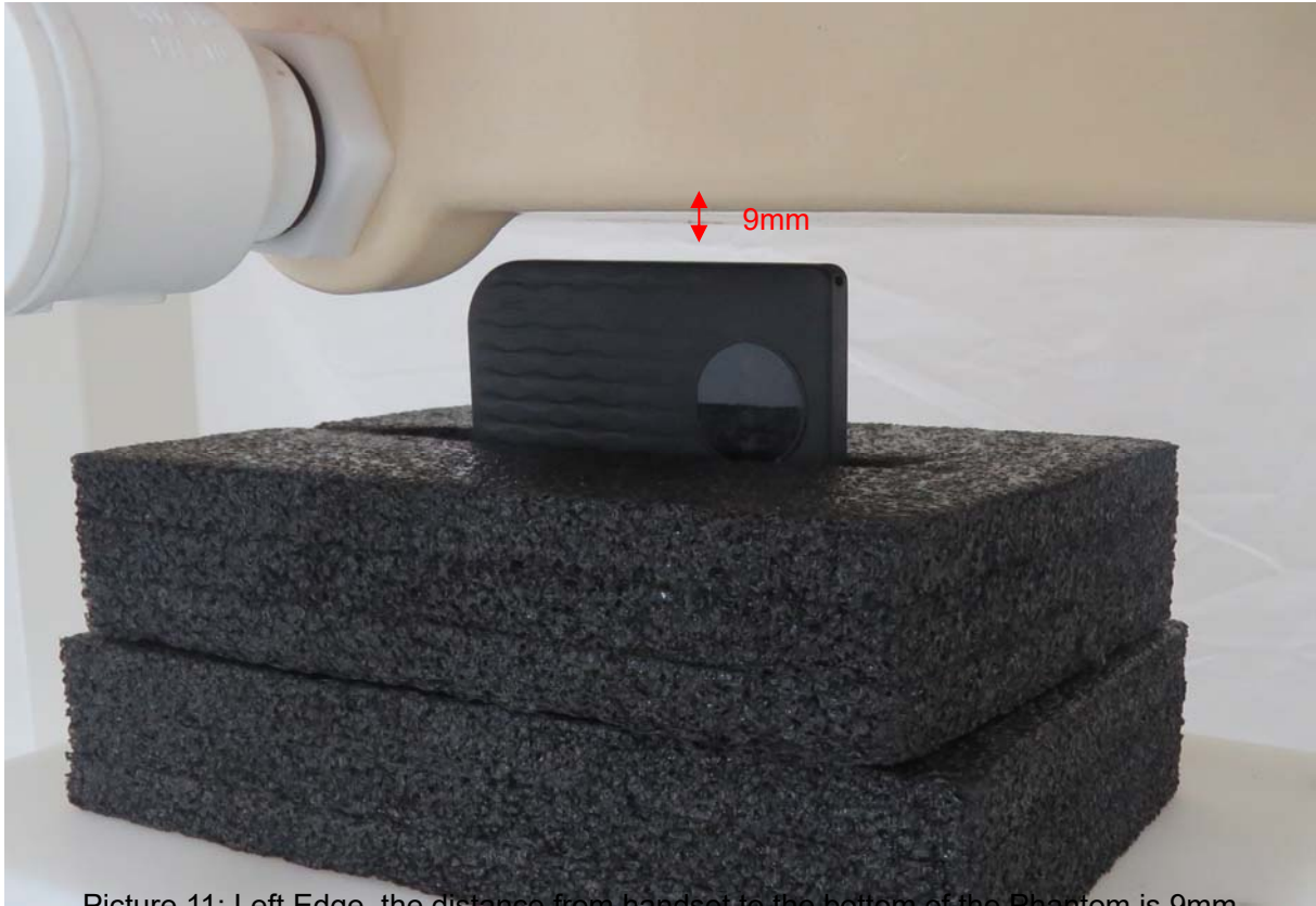
Picture 11: Left Edge, the distance from handset to the bottom of the Phantom is 9mm