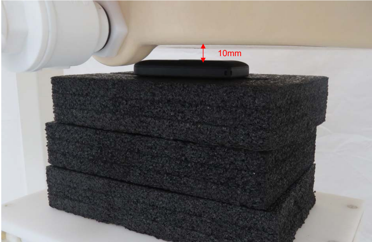
Picture 3: Back Side, the distance from handset to the bottom of the Phantom is 10mm