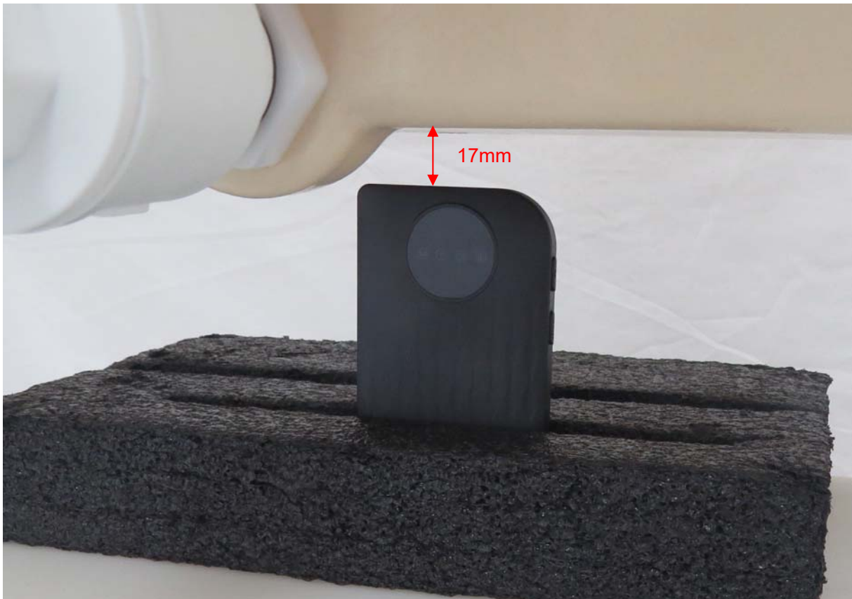
Picture 12: Top Edge, the distance from handset to the bottom of the Phantom is 17mm