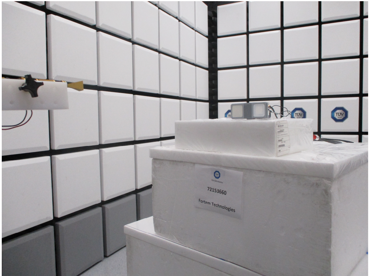
Radiated Emissions Test Setup (above 40GHz)