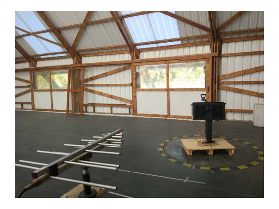
Photograph No.4 Radiated emissions measurement setup at the OATS in 200 – 1000 MHz