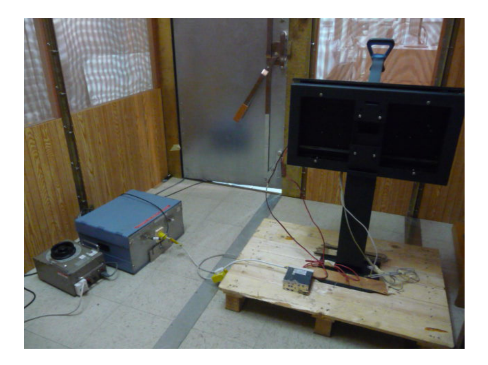
Photograph No.7 Setup for conducted emission measurement on AC power lines