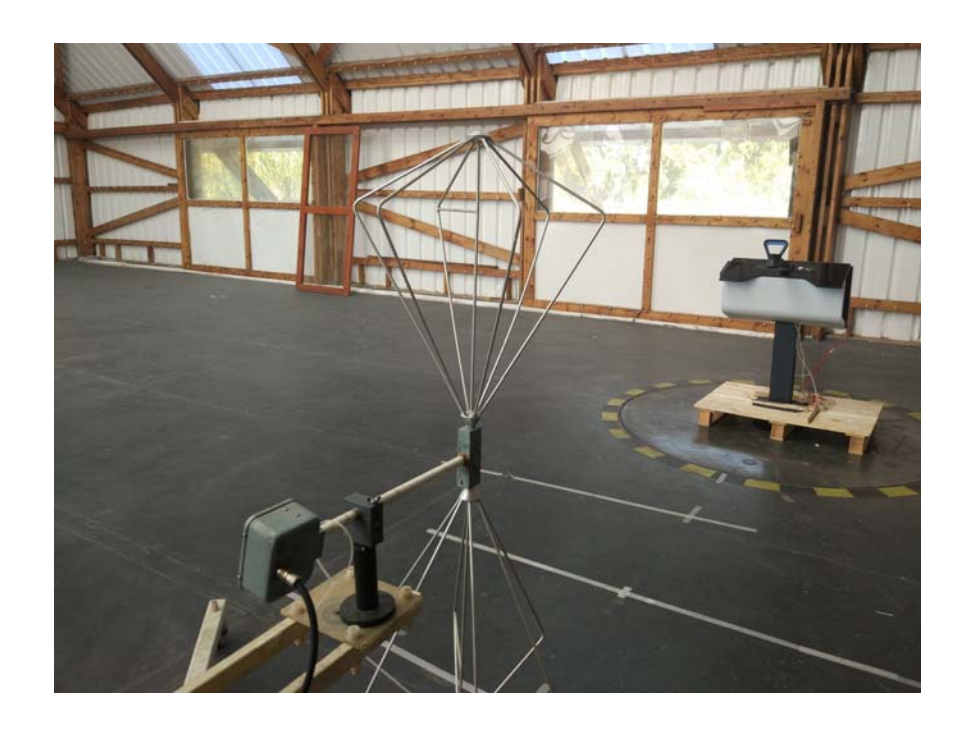
Photograph No.3 Radiated emissions measurement setup at the OATS in 30 – 200 MHz