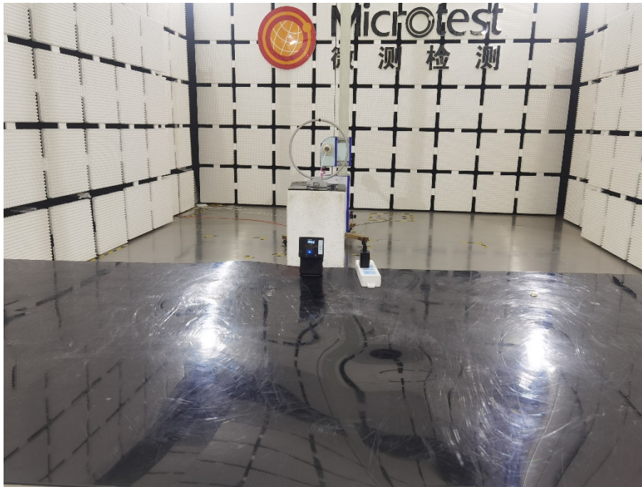
Radiated emissions – Below 1 GHz