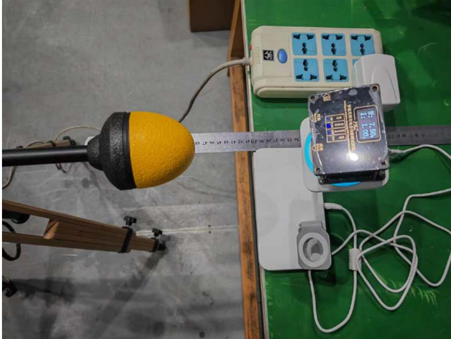
7.5W for WPT1: