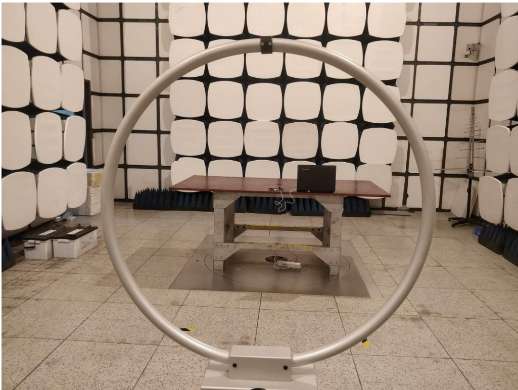
Radiated Emission below 30MHz-PC charge mode