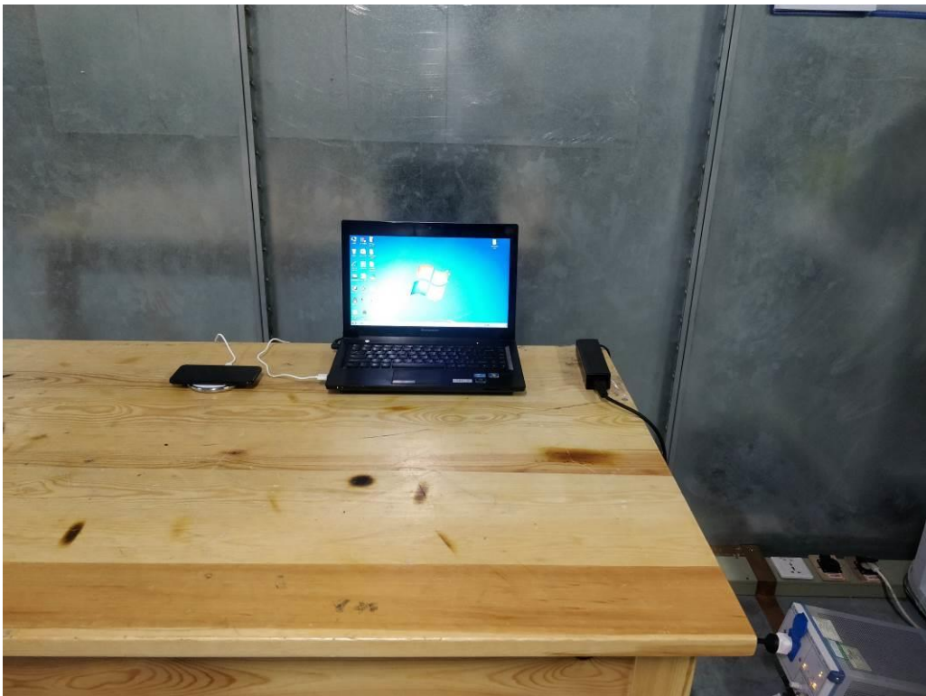
Conducted Emission-PC charge mode