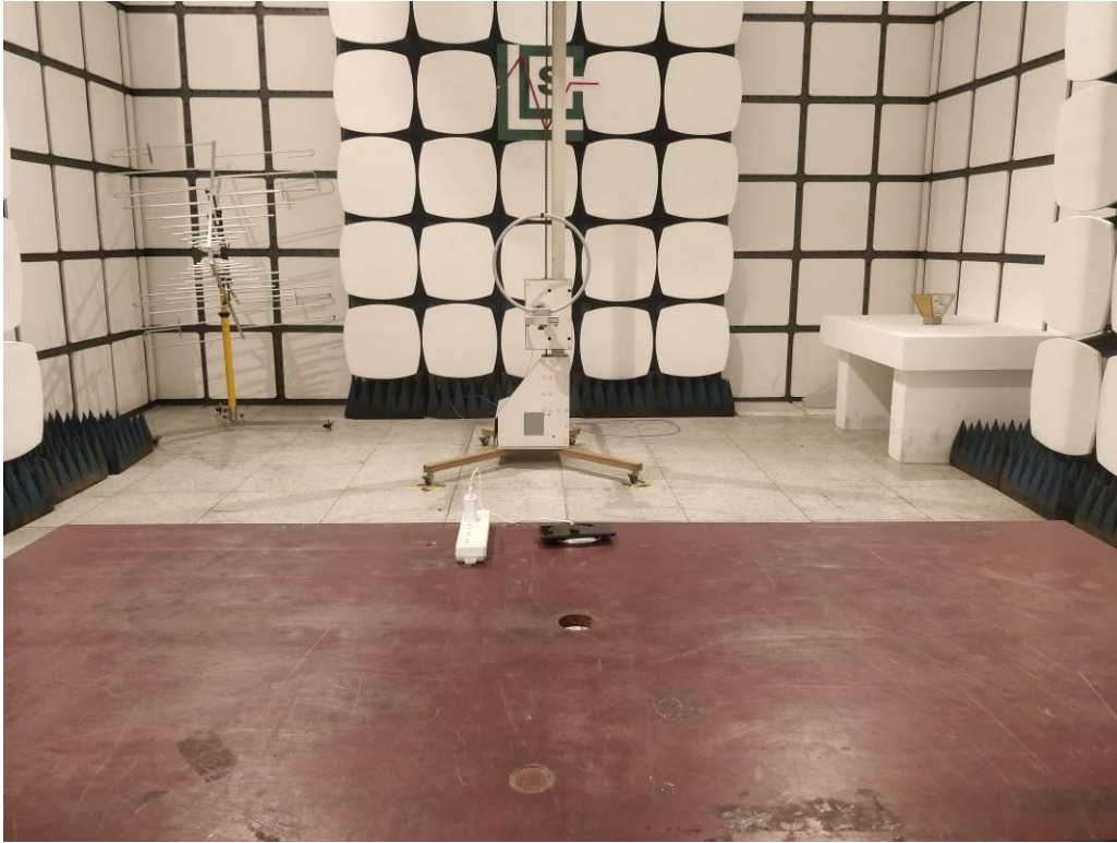
Radiated Emission below 30MHz-AC adapter charge mode