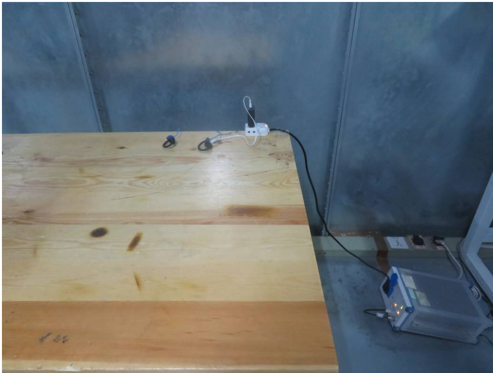
AC Conducted Emission of charge from power adapter mode