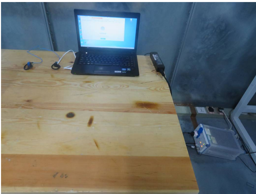
AC Conducted Emission of charge from PC mode