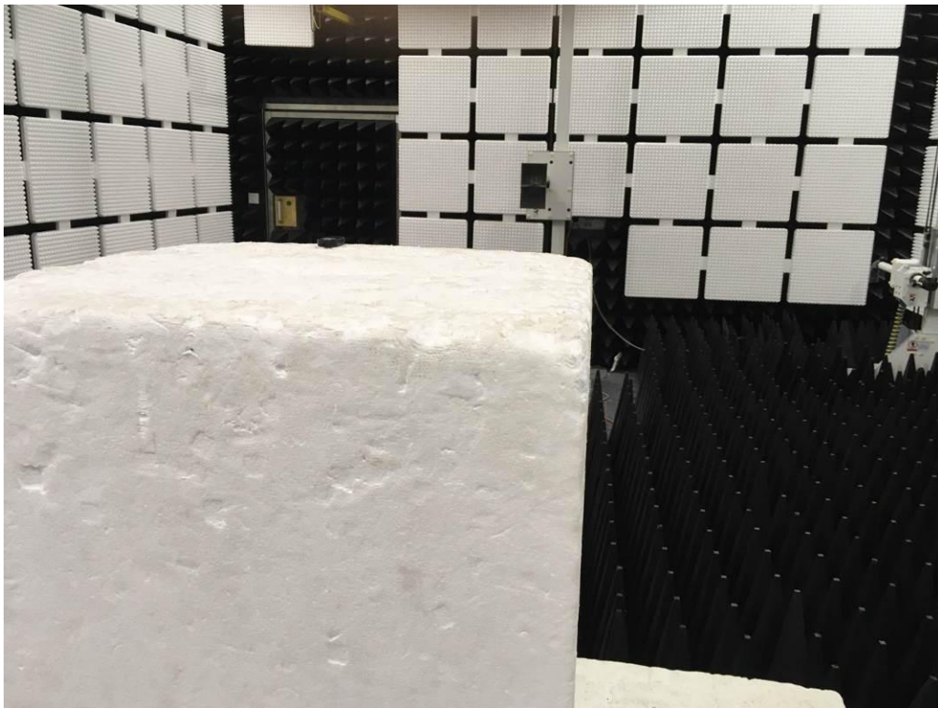
Above 1 GHz