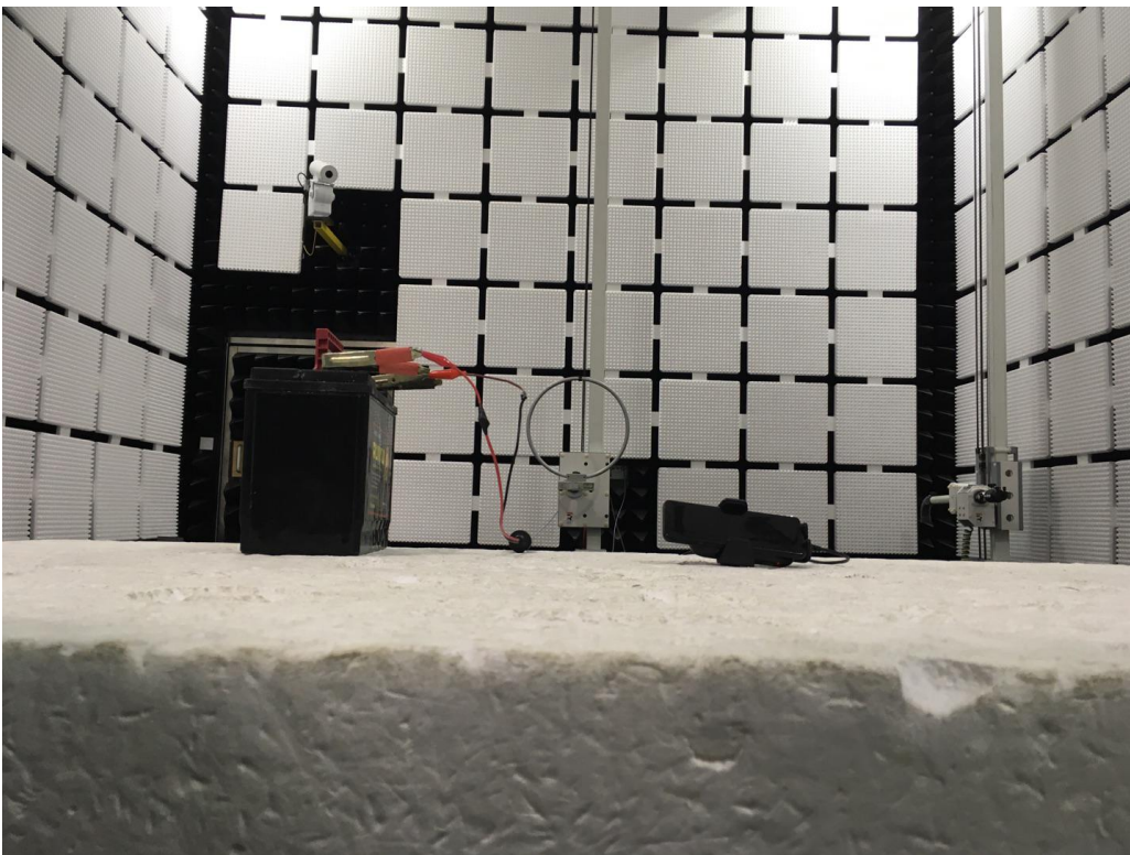
Radiated Emission below 30MHz