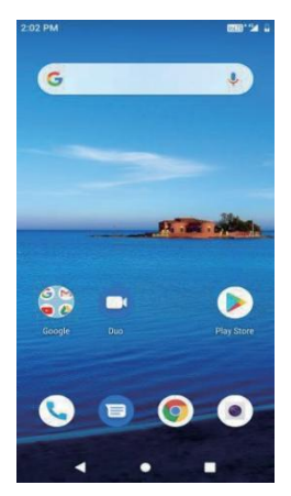
phone message browser camera