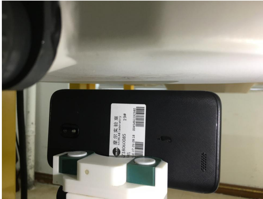
Body- Left (10mm)