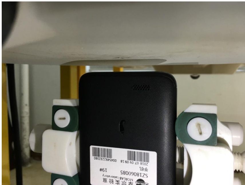
Body- Bottom (10mm)