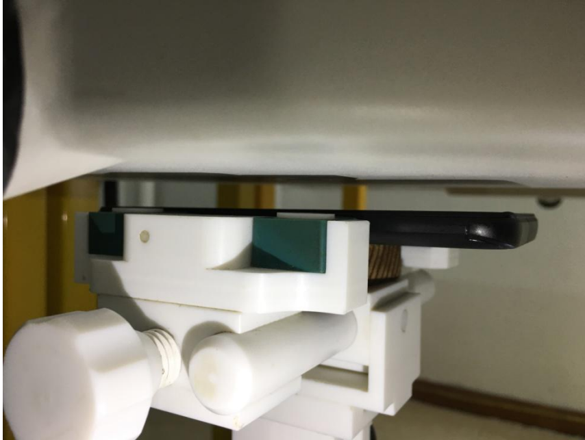
Body- Front (10mm)