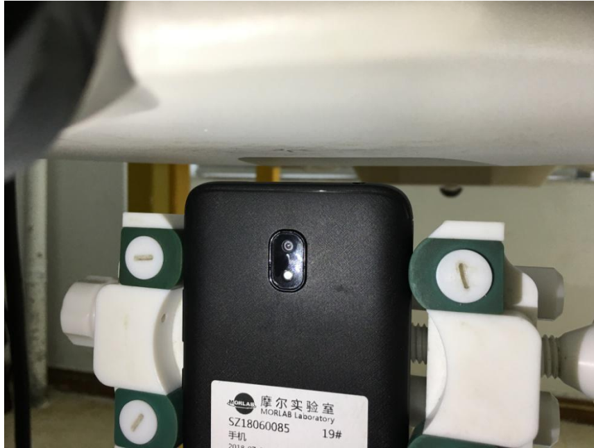
Body- Top (10mm)