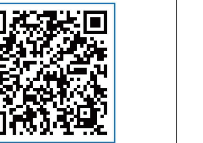
Scan QR Code and Download

Scan the following QR code, download and install the App.