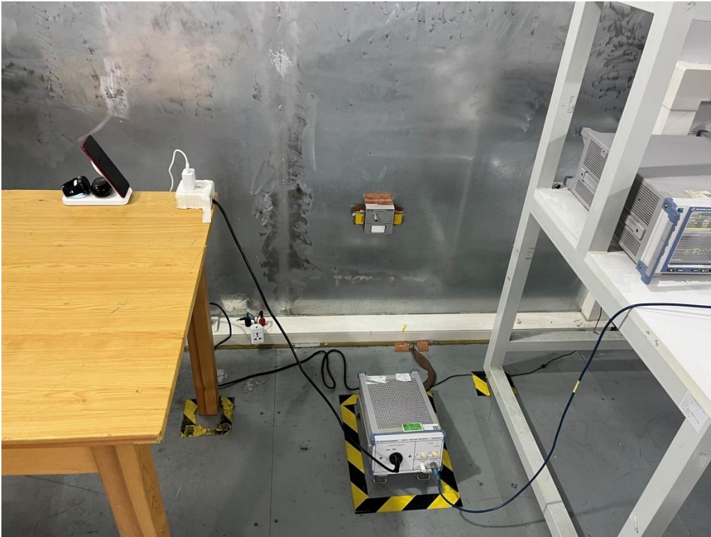
Conducted Emission-AC adapter charge mode