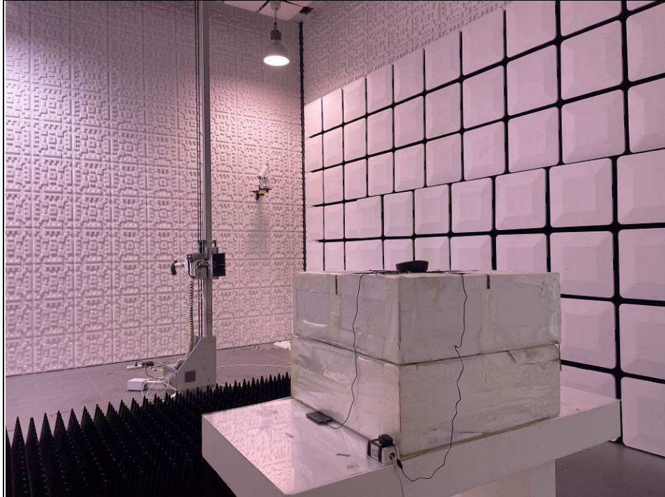
Frequency Range < Above 1GHz >